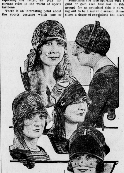
Some Gorgeous Millinery.

Sometimes the lace sparkles with a glint of gold (see first hat in this group) for as promised this is turning out to be a metallic season. Sometimes a drape of exquisitely fine black