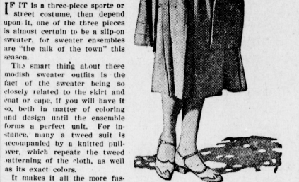
A Sweater Ensemble.

Children Cry for Fletcher's CASTORIA W. N. U., DALLAS, NO. 48-1927.