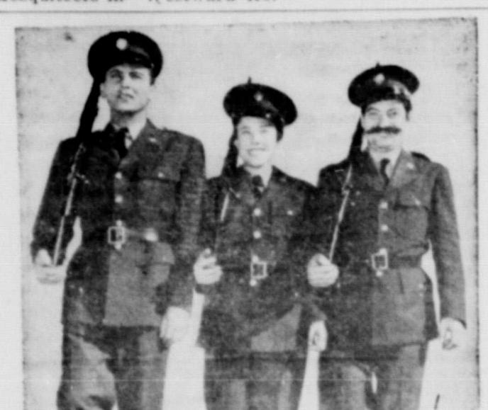
Showing Thursday at the Palace. Also giving away Free $150 Defense Bond Thursday night,