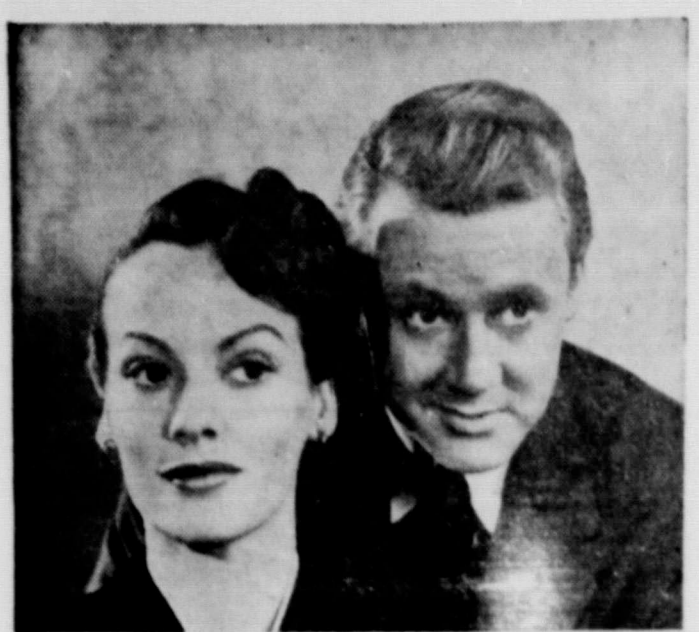
"Murder in the Big House," a tense thriller shrouded Friday and Saturday at Palace. Also showing, Three Mesquiteers in "Westward Ho."