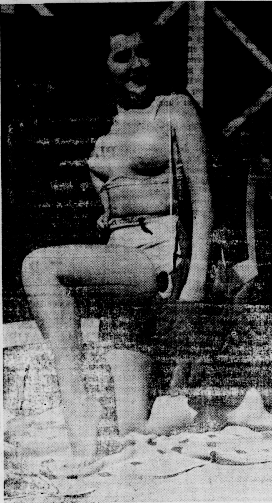
Mrs. Rutherford takes advantage of 1940's latest beach togs by carrying a shoulder bag of red denim modeled after a nice fat fish. It is padded and slips right across the middle, and is big enough for all the beach paraphernalia. For swimming the actress chooses a two-piece swim suit of yellow tulle. The trunks are (extra fitting with a half shirt which comes only in the front of the suit)

Training and experience are absolute necessities for expert reliable watch repairing. Henry Gruben at Sanders-Chastain has both.