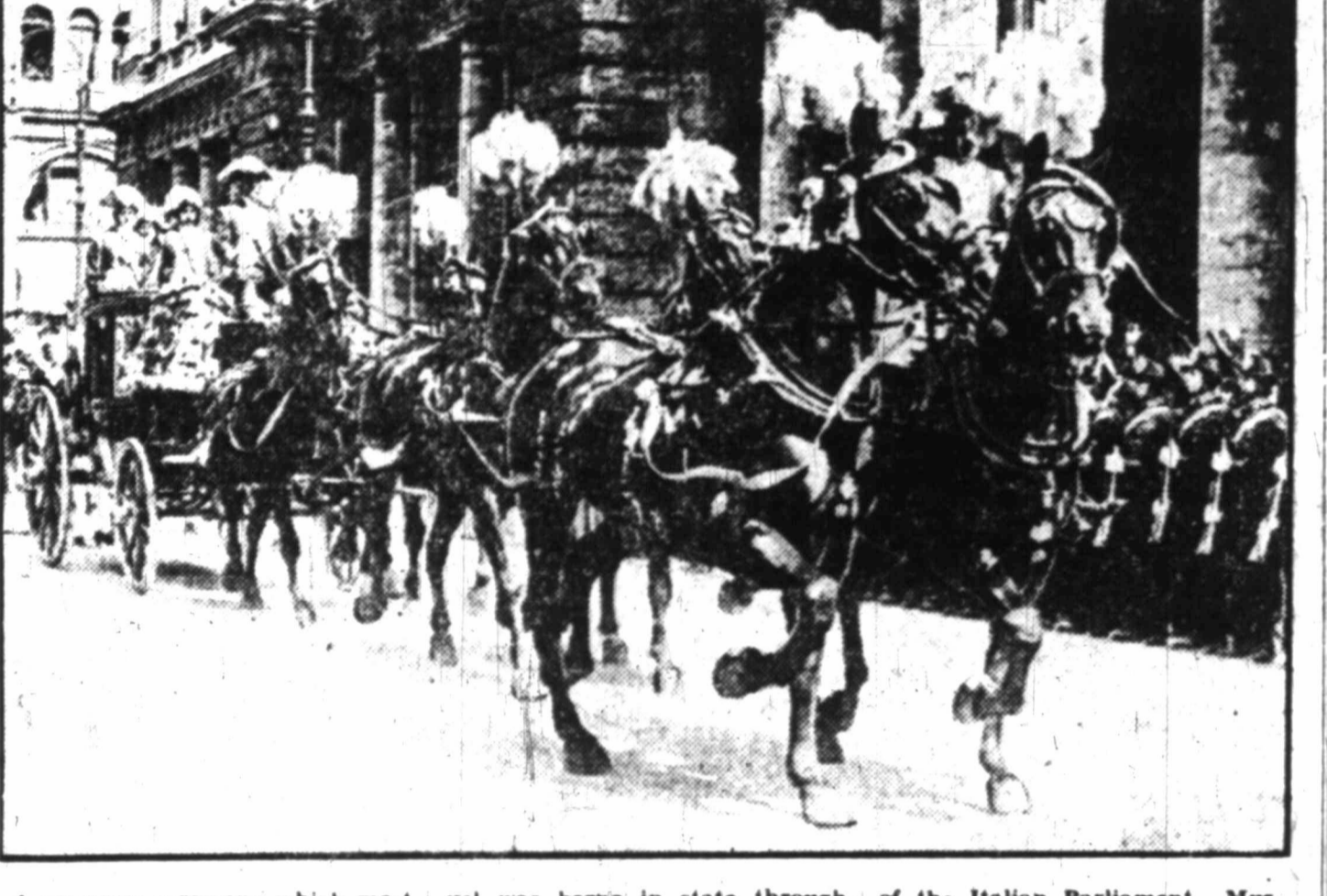
A pompous ceremony which most Italians thought they were looking on for the last time is here recorded as King Victor Emmanuel...