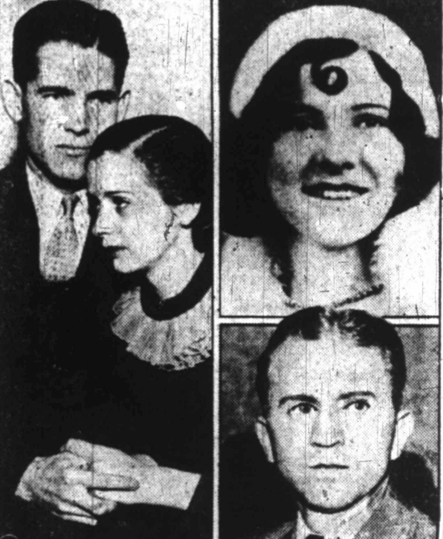
A young wife is dead by her own hand in Chicago and three survivors of a 'modern' love triangle...