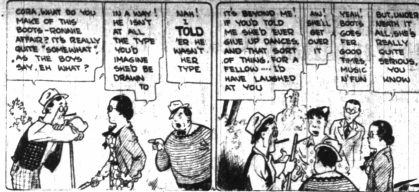
The Topic of the Day!