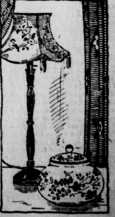
A Chinese Shade for Candlestick.

To Hang a Skirt. ONE of the most difficult things in dress-making is to make a skirt hang well. To get it even take a hoop and set it on the floor on little blocks of wood whose height is the number of inches the skirt is to be from the floor. Stand in the center of the circle and have some one mark the material along the top of the hoop with a piece of chalk. House Dress. A shirt waist and skirt make the neatest of house dresses, providing the skirt band does not sag, and, to prevent this, the band usually is worn too tight to be comfortable while at work. Sew buttons at regular distances apart on shirt waist band; in skirt band narrow, sew tape loops to correspond. When fastened to waist by means of these buttons and buttonholes or tape loops the weight of dress hangs from shoulders, as it should. Do not use hooks and eyes, as these will cause rust spots when sent to laundry. Work Aprons. When making work aprons have the top of the middle breadth made double for about ten inches from waist, stitching it in with the seams and belt, with the edge loose. This gives a patch that does not show until it is needed, yet always ready when the top is worn through.