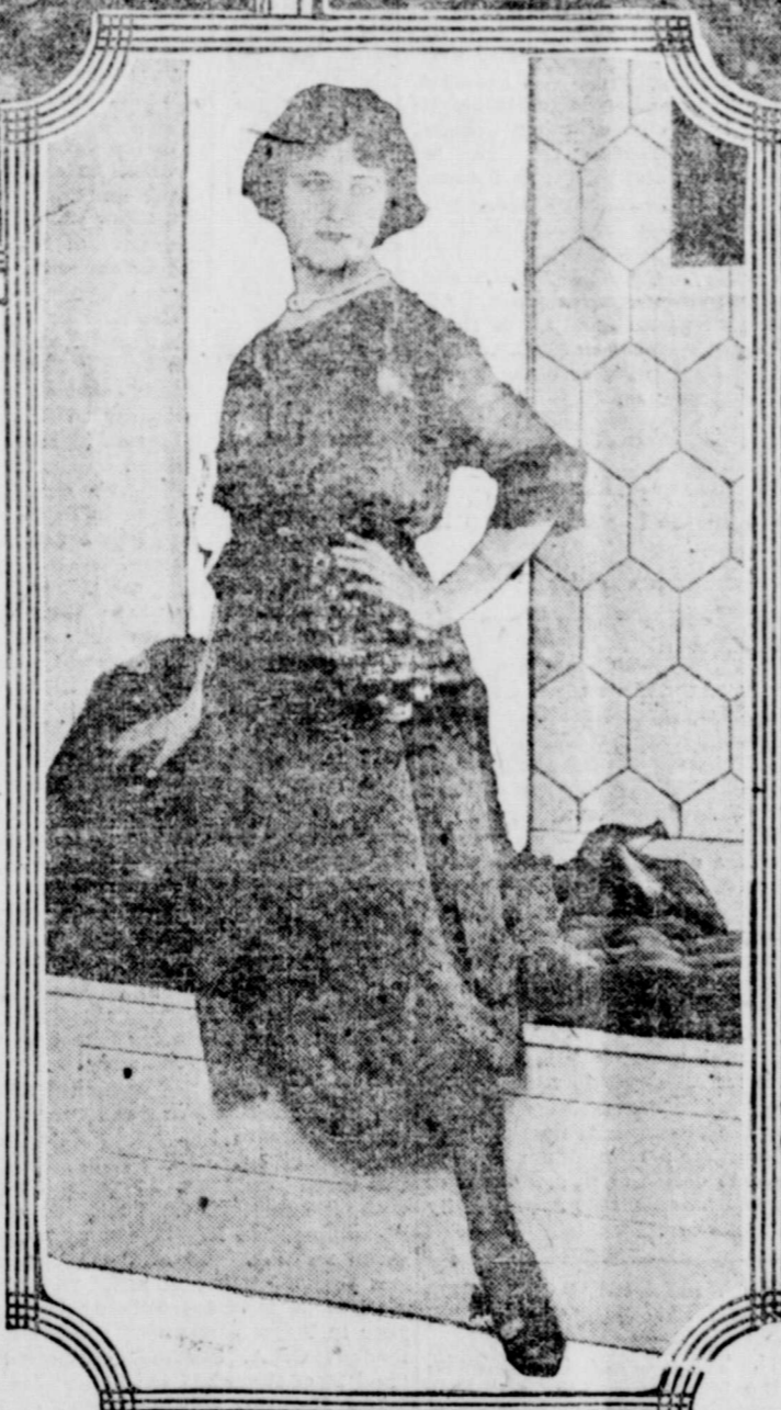
SOLID BLUE CHIFFON COMBINED WITH AN ALLOVER DESIGN CHIFFON IN BLUE AND RED

Don't underestimate the importance of the glove. One of the newest styles for warm weather wear is a gauntlet, white with black stitching and a new side seam of black kid. Young girls will wear turbans, even though they are inclined to make them seem a wee bit older. Silver metal cloth combined with black jet has a decidedly smart effect. For the dainty, frilly type of femininity there is this vestee in white net and full ruffling of lace, the lace falling below the waist line, giving a new and smart effect. An all-over and solid chiffon combined spell frock smartness. A narrow knife pleating of chiffon trims collar and sleeves. An upper part of skirt the pleating gives a slight fullness at the hips.