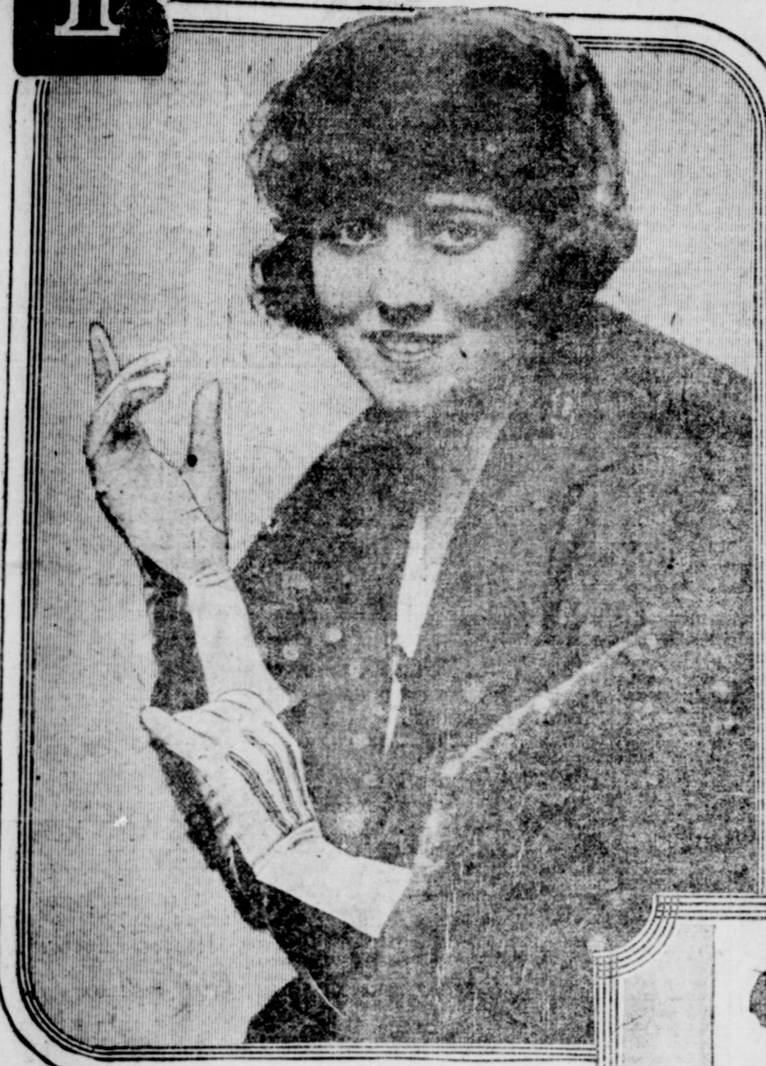
A NEW GAUNTLET GLOVE