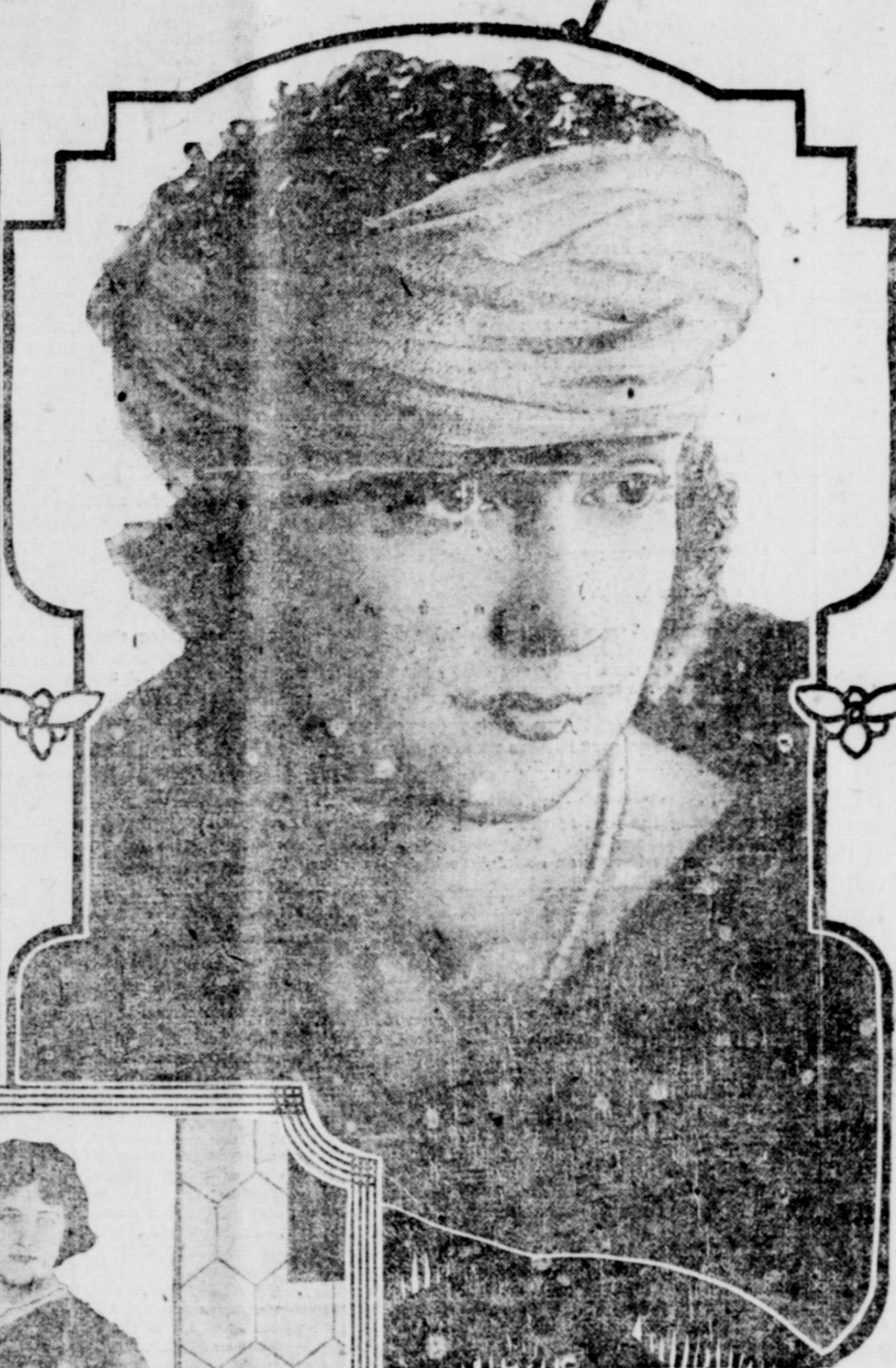
A Turban of Silver Metal Cloth and Black Jet.