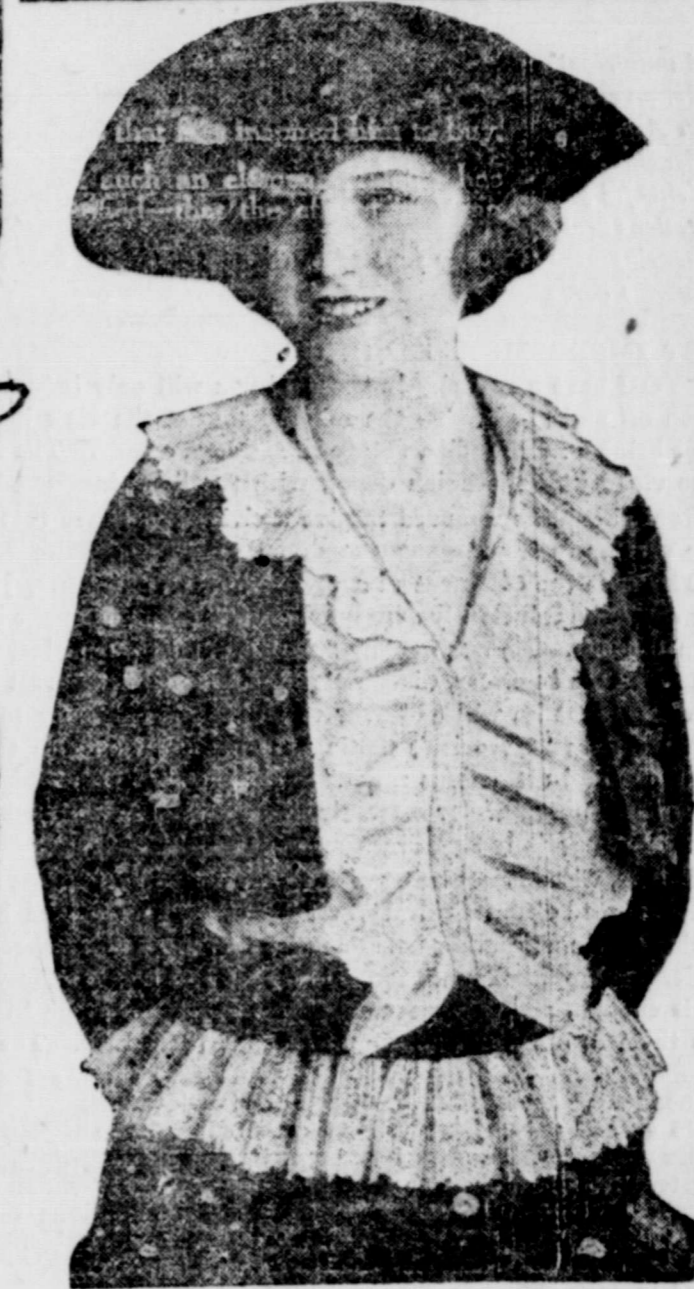
A NEW VESTEE IN WHITE NET and LACE