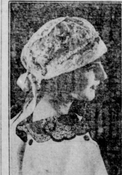
The Bonnet Style Is Well Liked Because It Covers The Hair So Well. Pink Ribbon And Cream Lace Combine In This Cap And Little Roses Add Their Dainty Touch.

There are dashing black negligee hats too—to go with flimsy black negligees. This year black is so fashionable that, of course, it has invaded the realm of boudoir wear and summer negligees are apt to be of black chiffon or Georgette, or of thin black Chinese silk with butterfly picot-edged hats to match them are of black lace and net or of corded black organdy.