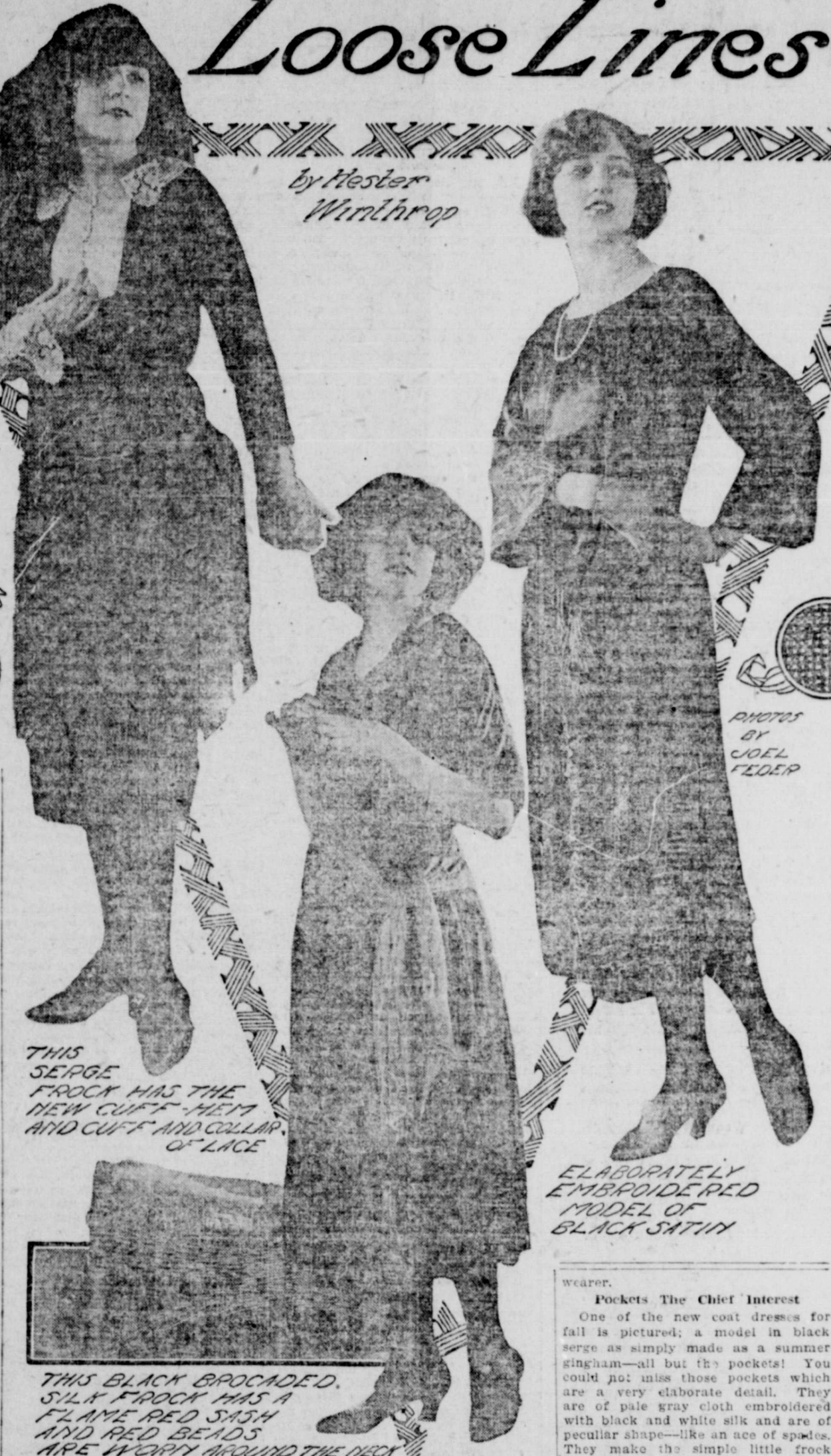
THIS SERGE FROCK HAS THE NEW CUFF—HEM AND CUFF—AND COLLAR OF LACE

Flowing Sleeves Or Drooping Cuffs Few of the fall frocks have sleeves chopped off to show the elbow though here and there such a model appears. Most frocks sleeves are in three-quarter length and flow outward toward the edge, the width in some cases being exaggerated and the sleeve showing a deal of trimming. Drooping lace ruffles and cuffs are set on tight undersleeves which are attached to the fitted underslip of the frock. This effect is shown in the costume of navy blue tricotine just referred to. The lace sleeve frill and the lace collar are attached to a fitted underslip, and also the vestee of fine hand-tucked handkerchief linen. The underslip has a straight, narrow skirt with a cuff hem, but the chemise tunic is loose at the waistline and is drawn in under a sash that passes twice around the figure and has ends heavily weighted with bead fringe—a very graceful arrangement. Another straight loose frock of black brocaded