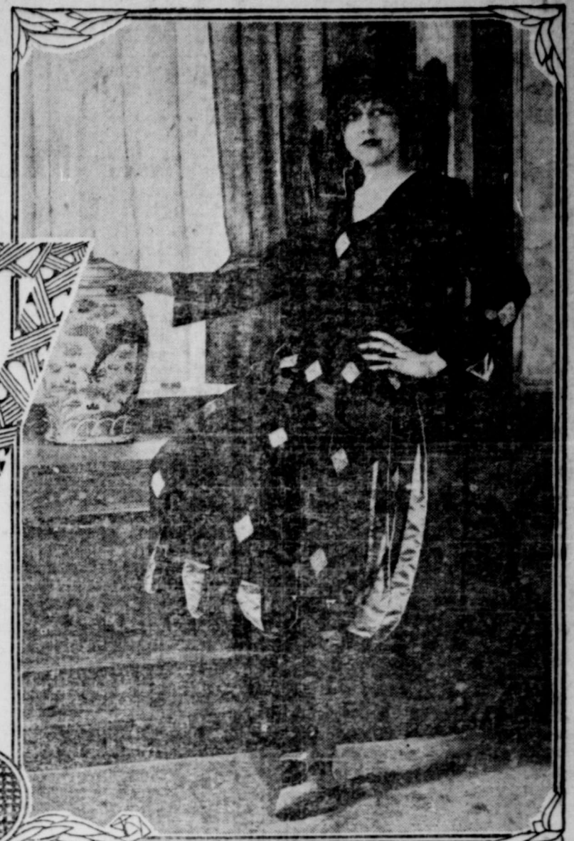
ON THIS FROCK THE SASH IS IN SEVERAL ENDS THAT TURN UP FROM THE SKIRT HEM TO MEET THE WAISTLINE

Pockets The Chief Interest One of the new coat dresses for fall is pictured; a model in black serge as simply made as a summer singham—all but the pockets! You could not miss those pockets which are a very elaborate detail. They are of pale gray cloth embroidered with black and white silk and are of peculiar shape—like an ace of spades. They make the simple little frock extremely individual and arresting. The long collar and panels, and the cuffs and vestee are of white broadcloth.