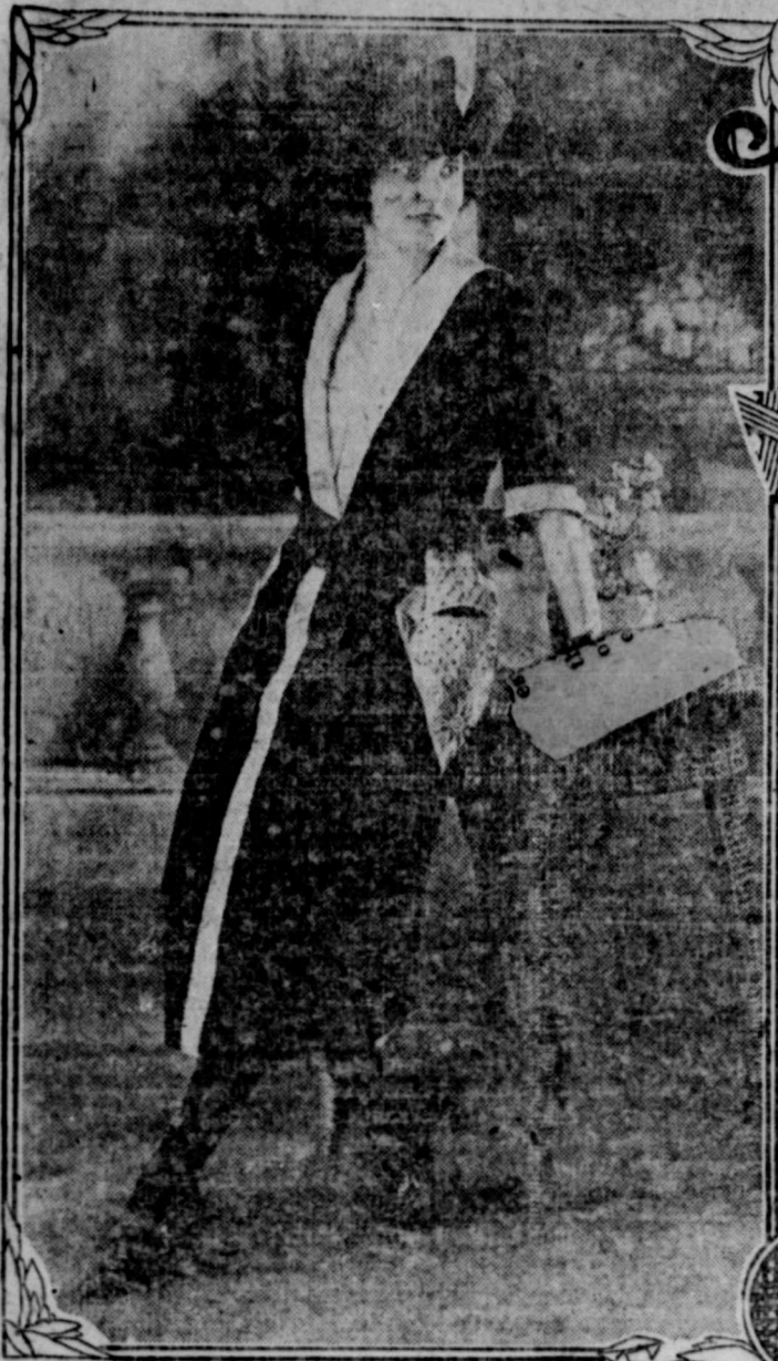
A SIMPLE FROCK WITH EMBROIDERED POCKETS AND SMART LONG PANEL FACINGS

Skirts Will Be Longer Soon — Tailored Dresses With Little Fitted Coat-Bodices — Chemise Frocks Go Over Fitted Underslips — Skirts Irregular At the Edge — Pockets.