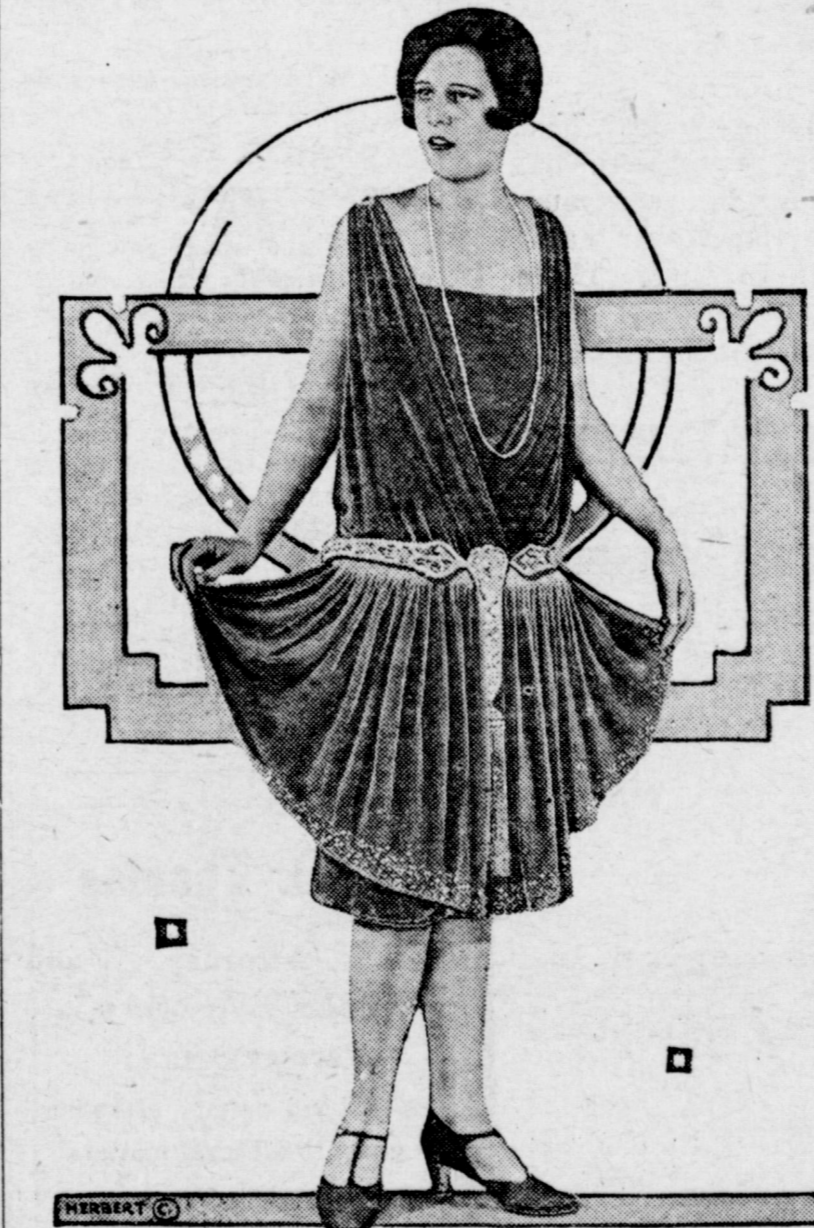
Chiffon Velvet Evening Gown.

to the recipient as to the use of this little flower basket.