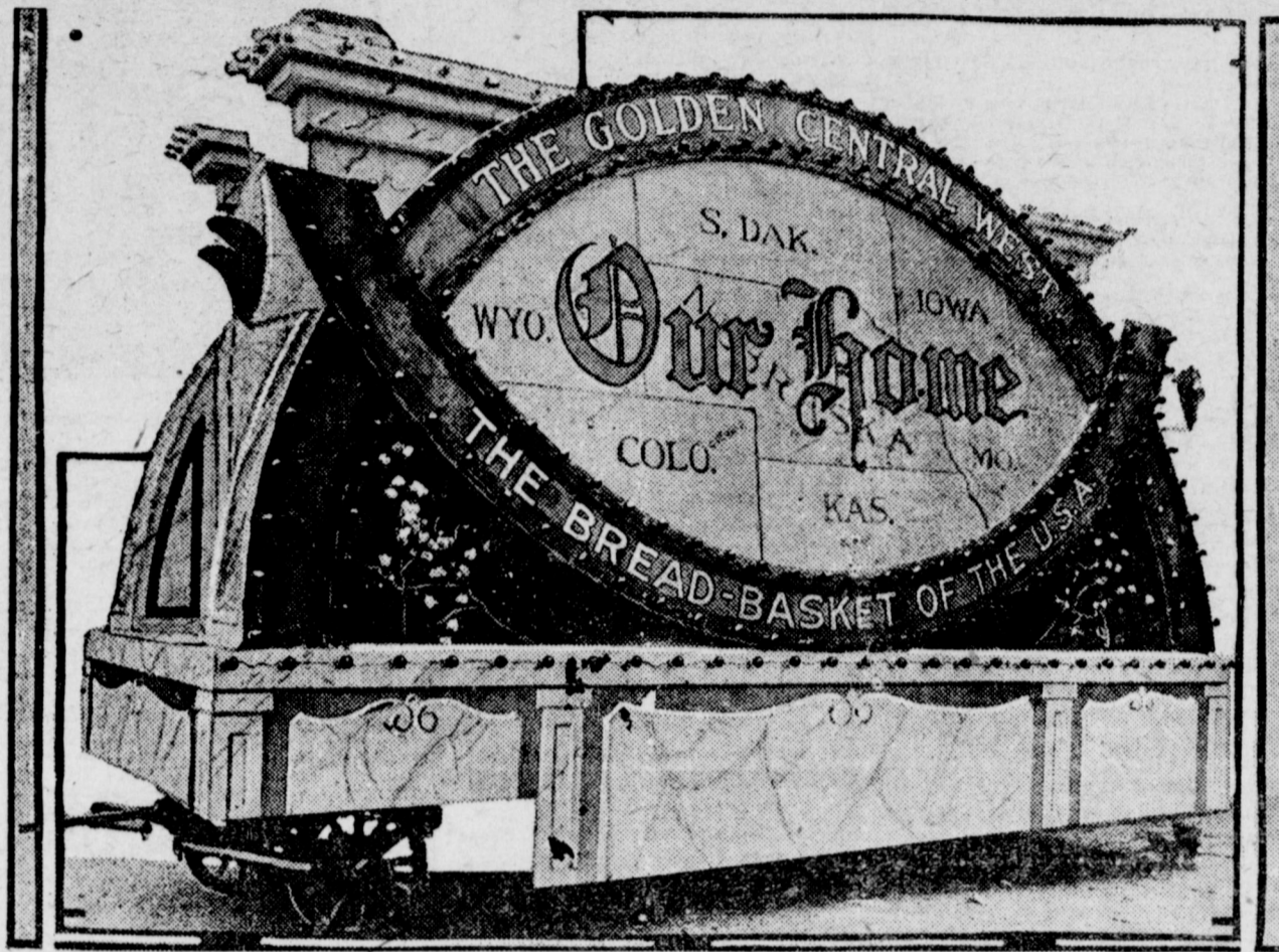
The grain-growing states of the Central West, the bread-basket of the nation, for the thirty-second successive year celebrated the close of the harvest season with an elaborate fall festival pageant at Omaha under the auspices of Ak-Sar-Ben. The big events were the electric parade on Wednesday night, September 29, and the great costume ball on Friday evening, October 1. That pictured above is the title float of the harvest pageant parade. Other floats pictured in elaborate detail the agricultural resources of the central western states. The pageant is the occasion of one of the big annual gatherings of the states of which Omaha is a central point.