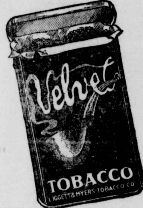
The Velvet tin is twice as big as shown here

A COMMON TRUCK When We Can Sell You an F. W. D. FOUR WHEEL DRIVE —at the same price of other trucks of lesser capacity, and include $700 extra "oversea" equipment. These trucks are new and come direct from factory. See Us Before Buying That New Touring Car TEXAN CARS AND TRUCKS LITTLE MOTOR KAR GARAGE Ninth Street, east of Avenue D