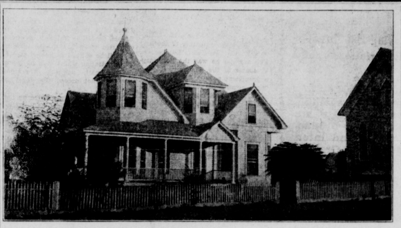
Parsonage of Cisco Methodist Church

new buildings were to be rented, but would mmodate a city almost the city.