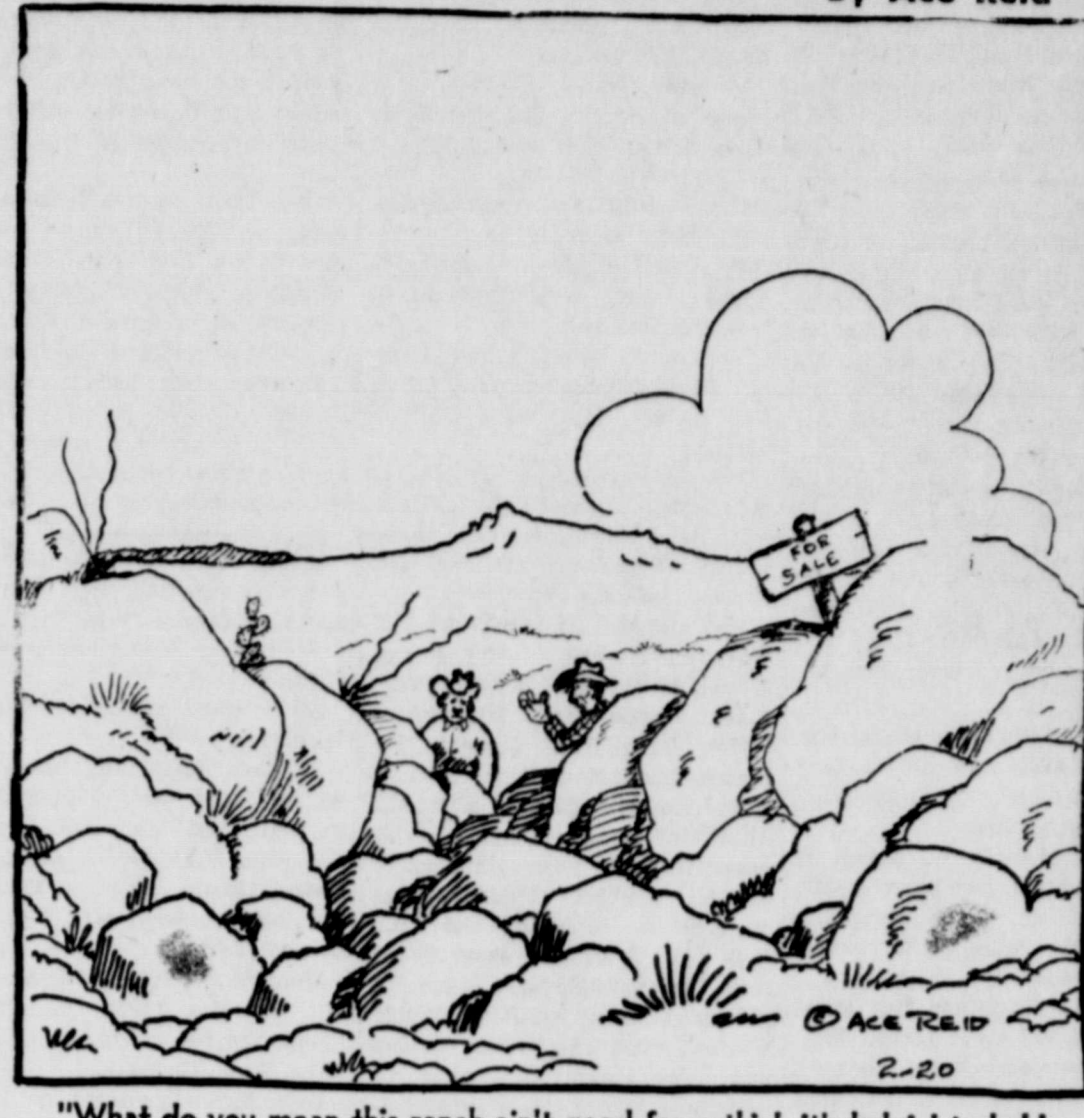
"What do you mean this ranch ain't good fer nuthin', it's helpin' to hold the world together, ain't it?"