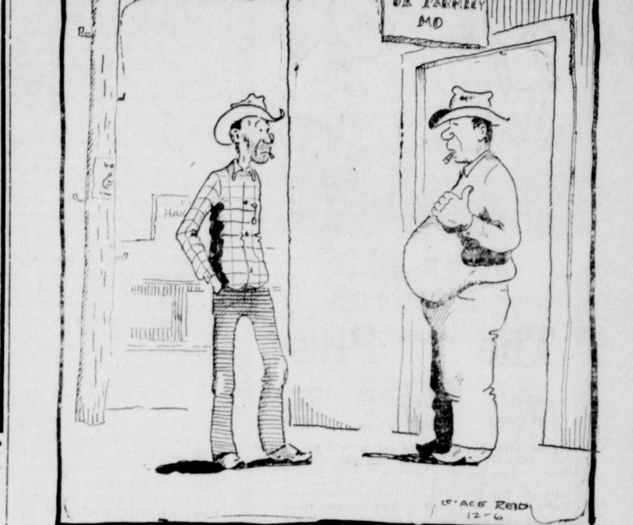
"That dumb doctor told me to watch my weight, and I told him that's all I've been doin' fer years!"