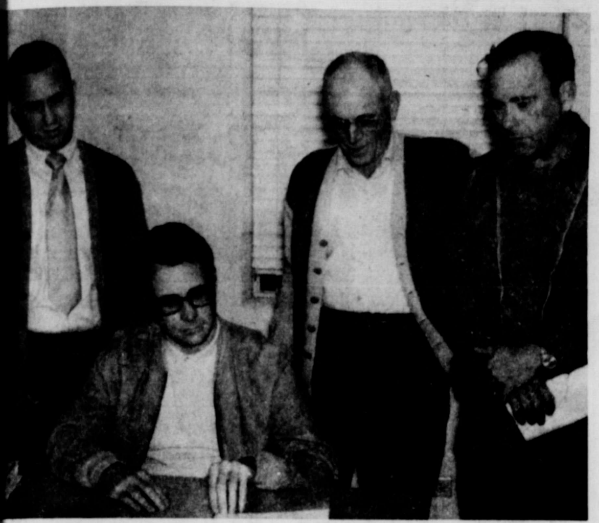
BOOSTERS - Officers ed at an organizational ng of Hico Quarterback held last Sunday evening,