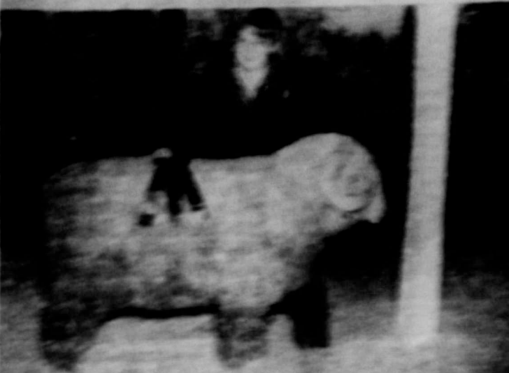
isse, age, of Event, showed both the grand champion billie and gannie at Hier Livestock Show