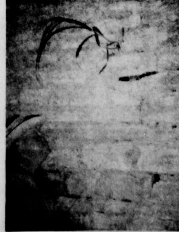
Red Lackey and his hay crop

The photograph here perhaps best describes the unusual growing conditions in the Hico area this year, and the plentiful supply of moisture up to this date. With an average rainfall of around 30 inches per year, the immediate Hico area has already received more than 33 inches to date, with an unofficial eight inches of rain falling in July.