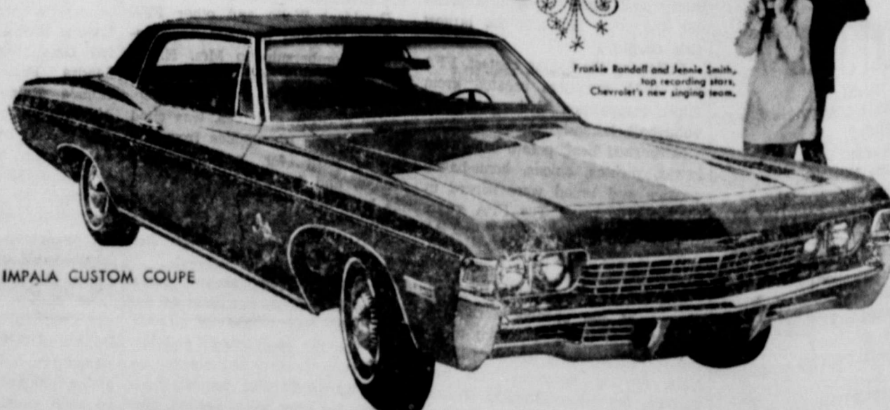
IMPALA CUSTOM COUPE