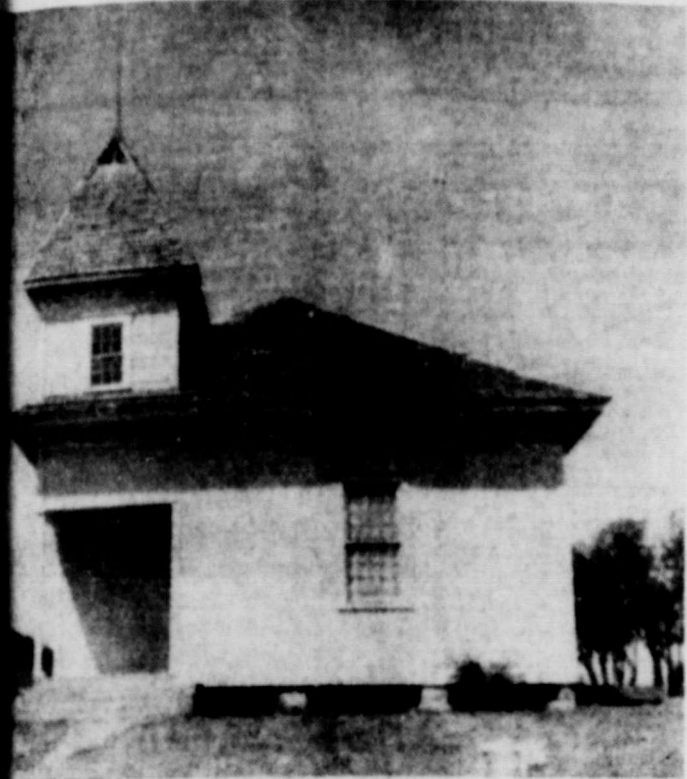
FAIRY METHODIST CHURCH ... Nominated for Medallion.

Fairy Methodist Church has been named by the Hamilton Council on Historical Society that it is eligible for a Historical Marker to be placed on the church grounds.