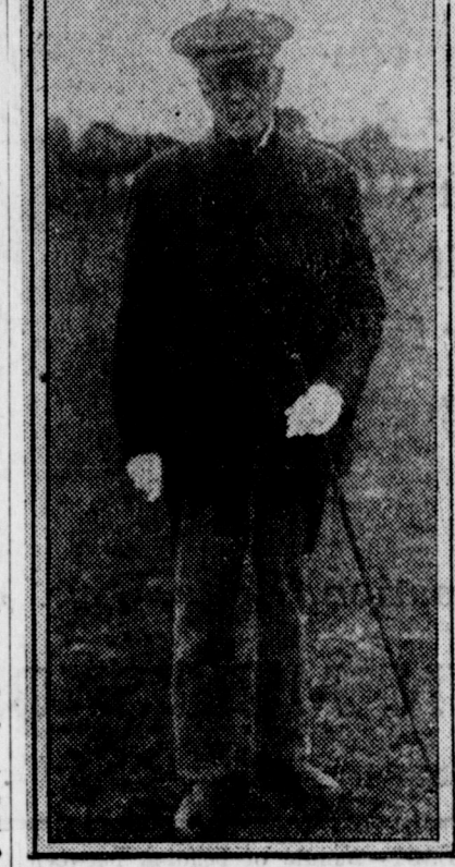
FIRST PHOTO THIS YEAR OF J OHN D. ROCKEFELLER ON LINKS.

A press dispatch of recent date car-Fe Railway Company has increased ing legislature at 2 o'clock today. dividends on accredited stock from six to 7 per cent, which is good news session to receive the message. to stockholders and the general publem to be swinging more and more to ried to all parts of the hall of repres-