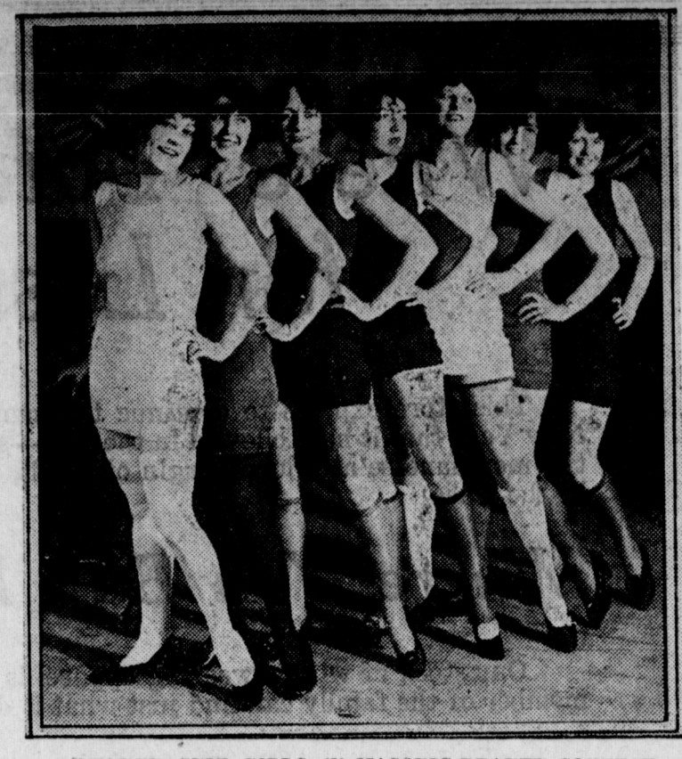
QUAKER CITY GIRLS IN MASONIC BEAUTY CONTEST.

Philadelphia-Here are some of the girls from this city who are enterng in the contest to determine the prettiest girl in Philadelphia. winner of the contest will be sent to Florida as the Philly representative n the Masonic beauty contest that is attracting beauties from all over