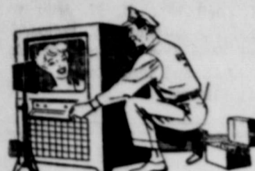
Dependable TV Service