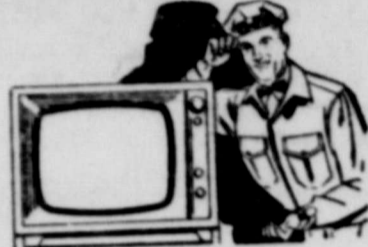
Skilled, Courteous Technicians