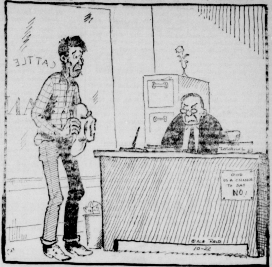
"President Tuernal, instead of sendin' me notices, you could apply that postage to my note... we'd git it paid off a lot sooner!"