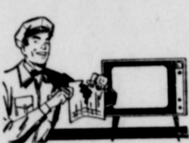
Everything at Modest Cost