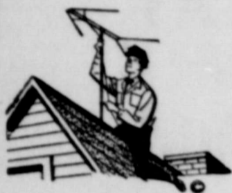
Correct Antennas Installed