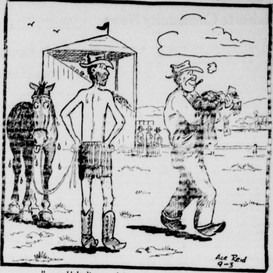
"... and I don't appreciate you insinuat' my runnin' hoss might make a trottin' hoss!"