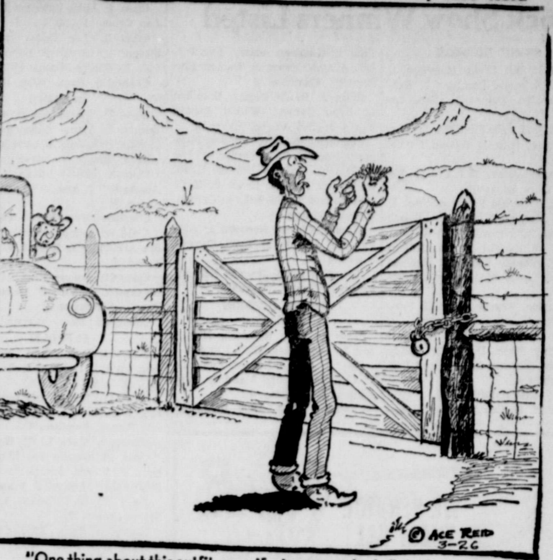
"One thing about this outfit, even if a trespasser had all the keys to all the locks, he'd git caught before he ever got through a gate!"