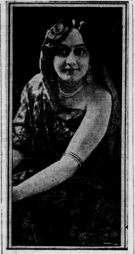
A Royal Beauty of India.

we believe it puts pep into our move- injury. ments, and then, too, we cannot help but believe that if we have a cold win- at which Ferguson presided, a resoluter we are assured of a crop success tion presented by S. A. King of Throckbeen the prediction of farmers who defer collecting the present automoclosely observe weather conditions bile tax until January 31 in order to and we believe that it is true. To be let the public get the benefit of the cold again at least serves to remind legislative reduction, was defeated, us that Christmas is near and that the speakers urging that such a step was New Year is rapidly approaching.