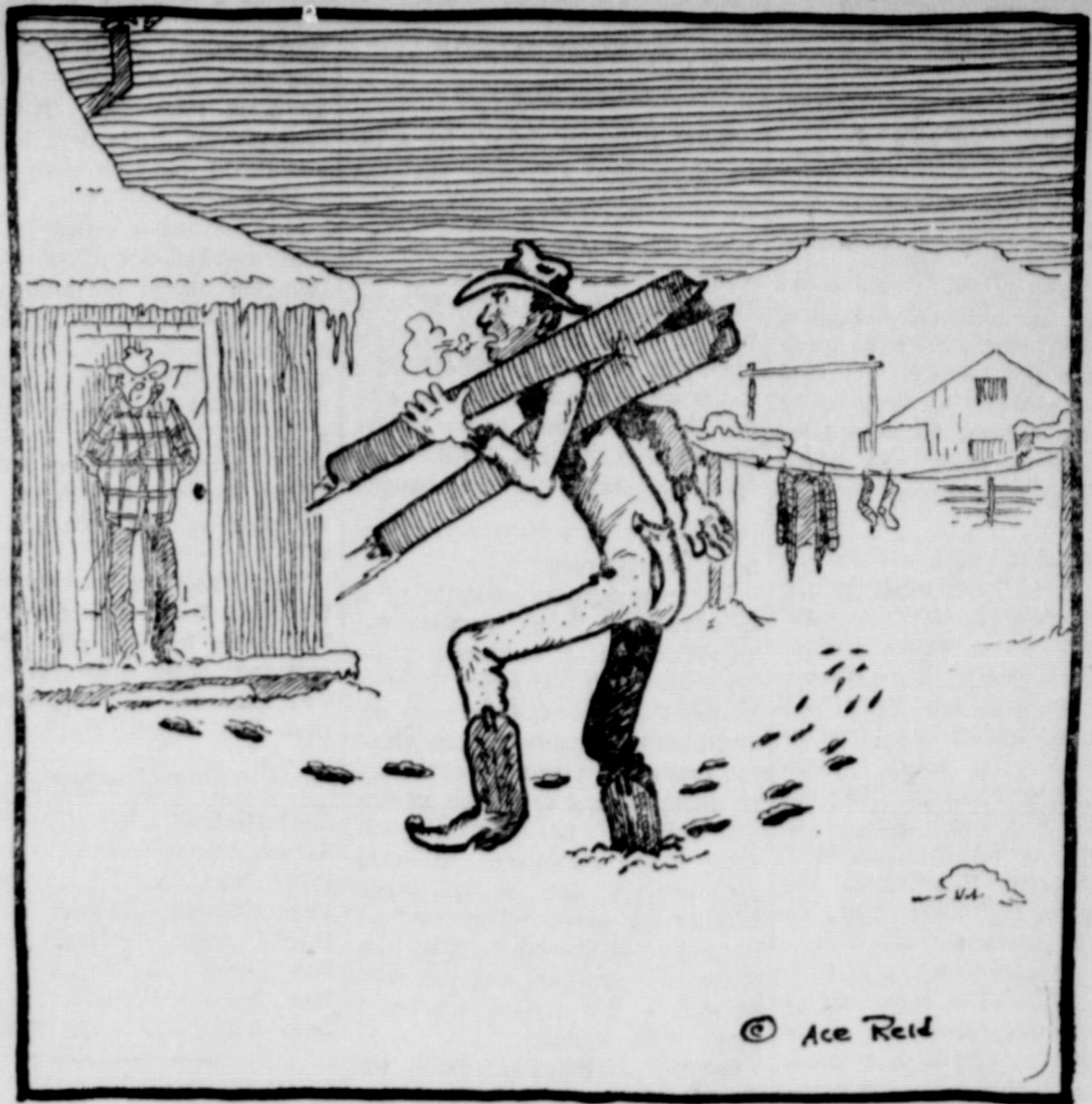
If I ever git these pants thawed out, I'm goin' someplace where they don't lie about the weather!