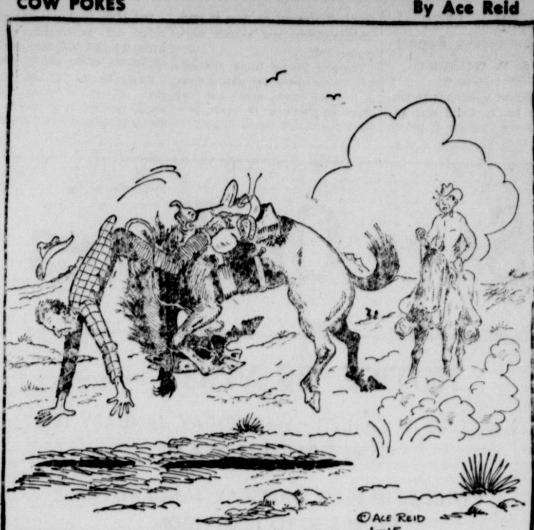
"Jake, don't you know the quickest way to spoil a good hoss is to start gittin' off over his head!"