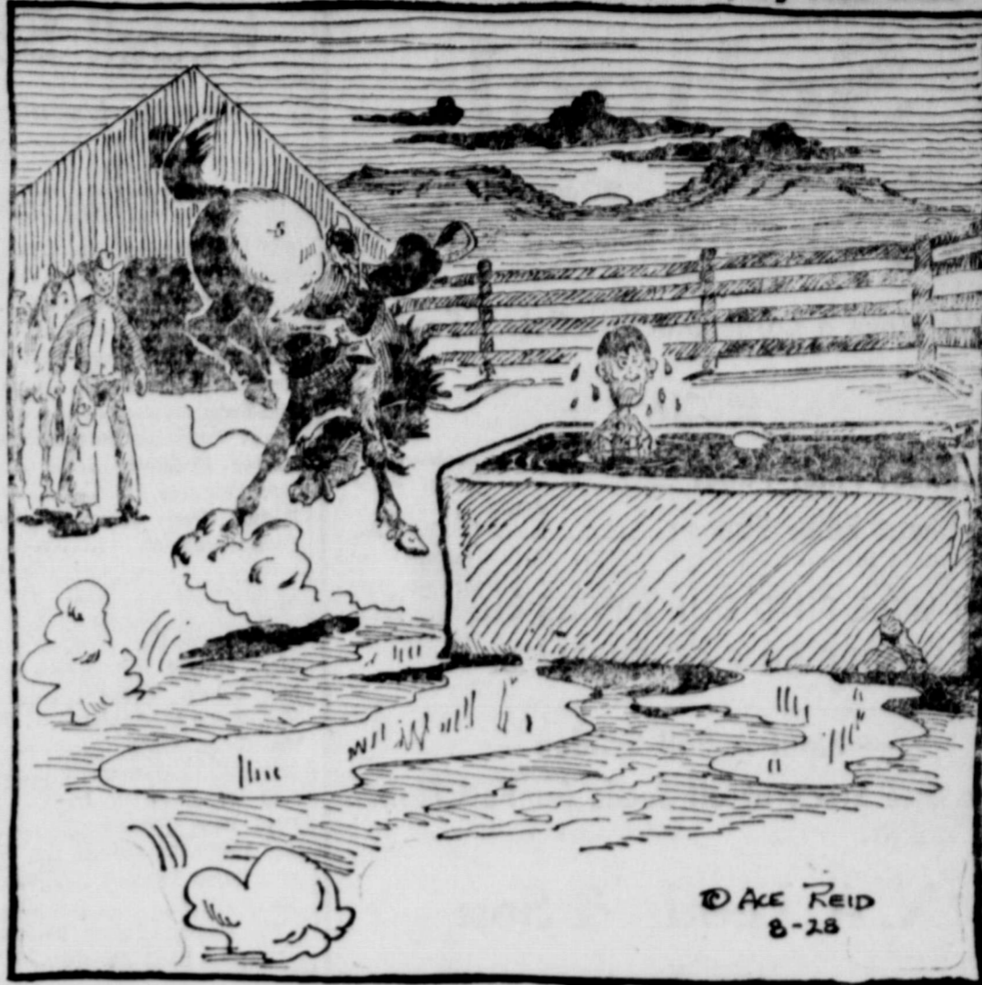
"Jake, you're the first astronaut to blast off, go into orbit, make yore re-entry and splash down before breakfast!"

of Stephenville. The services were held Friday afternoon.