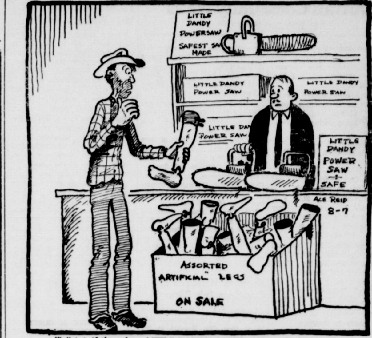
"Mister, if these here LITTLE DANDY SAWS are so safe, how come you're sellin' so many wooden legs?"