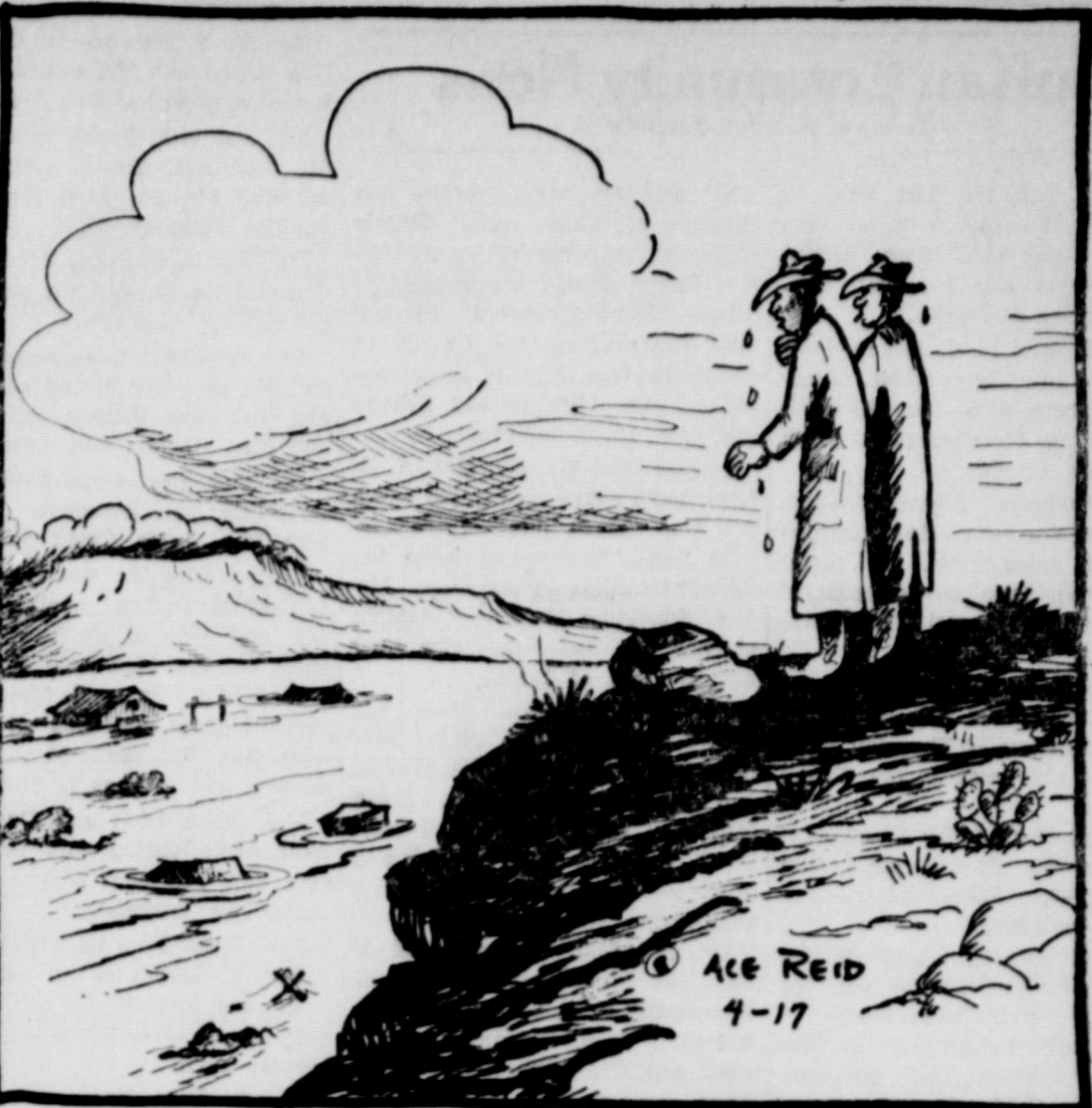
"Wul, this year we've had 13 inches of rain . . . too bad it all had to come in the last two hours!"

and in Old Mexico. They returned home Friday.