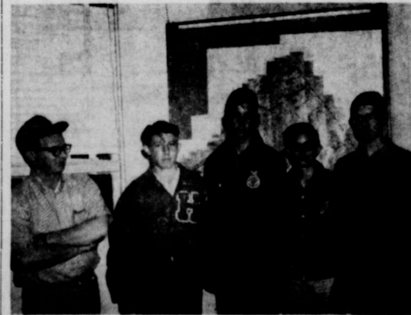
4th PLACE WINNERS—Members of Hico FFA Chapter and judging team, winners of fourth place in a recent Hamilton-Coryell Soil Conservation District contest, are pictured here. From the right