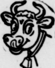
"Give Your Herd the Best"