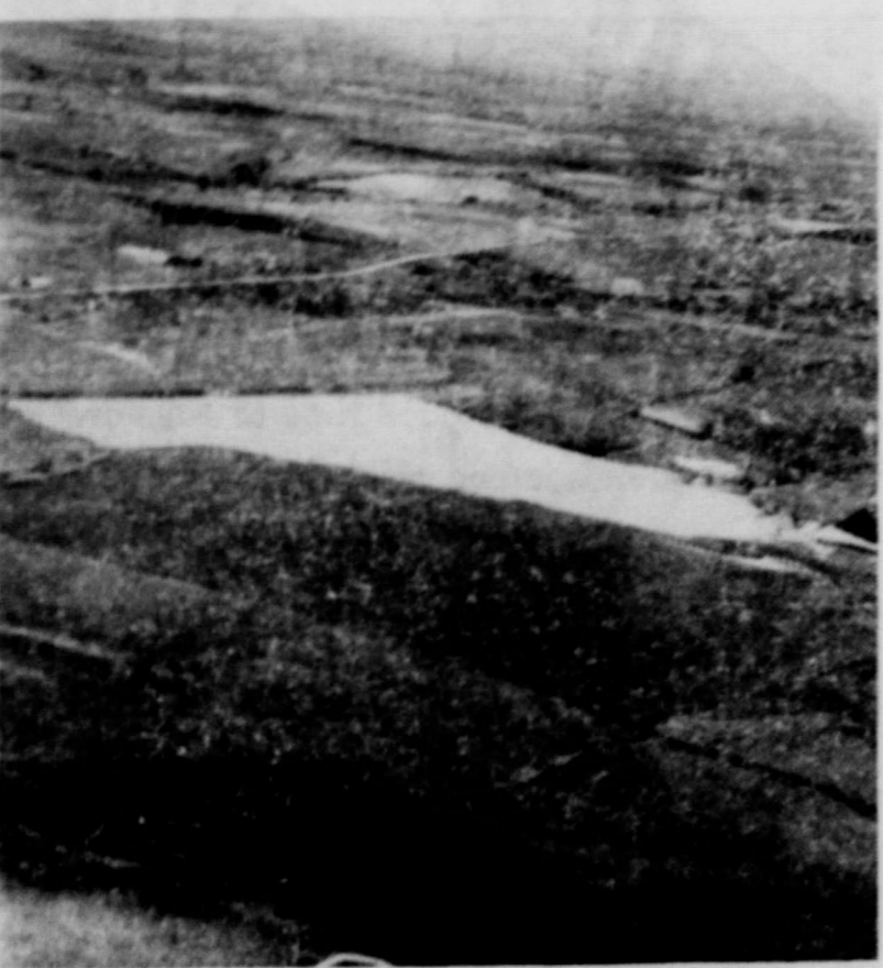
TYPICAL STRUCTURE — Typical of the many flood prevention structures being built in this area is this one somewhere in Central Texas. Work is progressing satisfactorily on the Upper Bosque program, which includes 29 such structures.