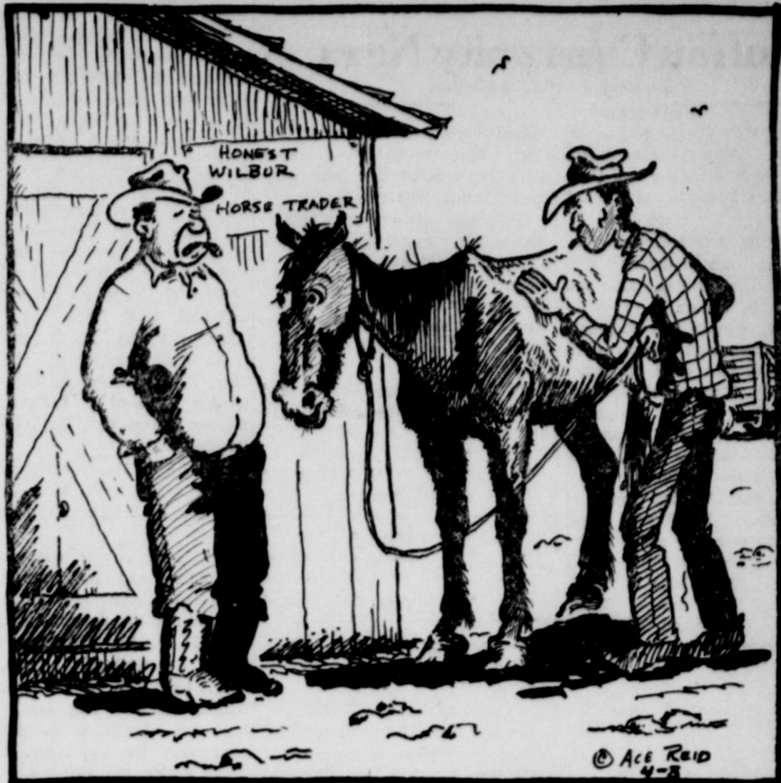
"Shore I guaranteed this hoss to have everything . . . jist everything . . . tender feet, sore back and colic too!"

FOR SALE: Heavy duty ACE Staplers, high initial cost, but will last a life-time. $7.50 each. Hico News Review.