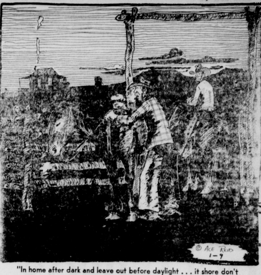
take long to spend the night on this place!"