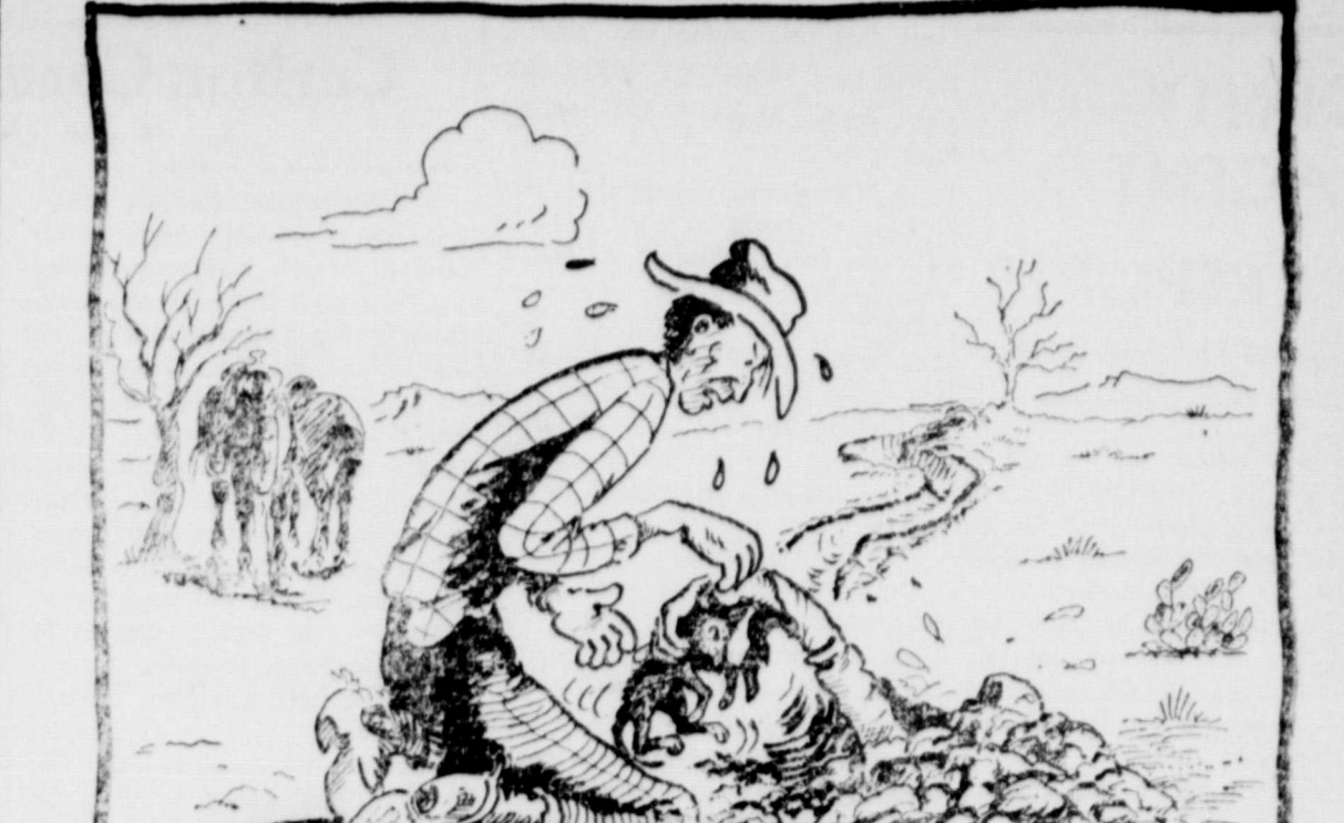
Wear out two good $100 cowboys, an $8 shovel fer a pair of $2 ears off a two bit covote pub.