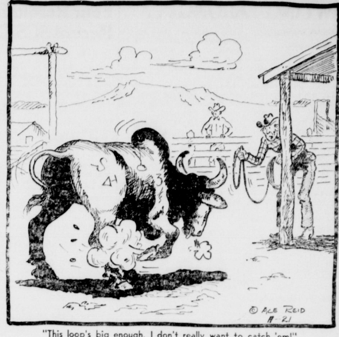
"This loop's big enough, I don't really want to catch 'em!"