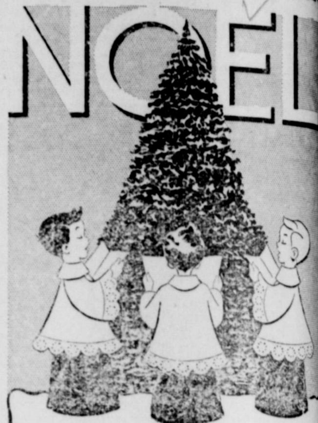
A Merry Christmas To All Of Our Friends.

"Hark the herald angels sing—C'ory to the new born King". We join with happy folks everywhere in wishing you a Merry Christmas.