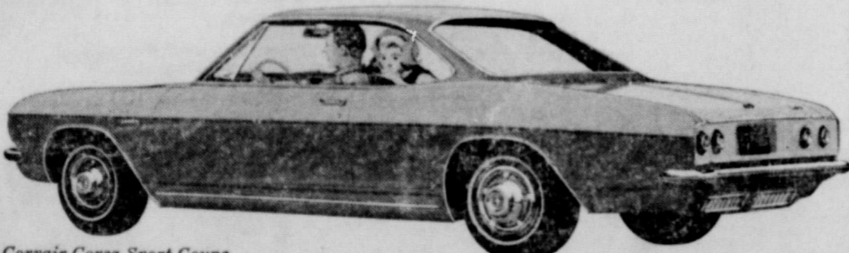
New Corvair Corsa Sport Coupe

It's '65's biggest, most beautiful change. There's striking new styling. New length, width and lowness. A roomier new Body by Fisher housing an interior that's a knockout. And a more serene Jet-smooth ride with a new Full Coil suspension system. Fact is, if you overlook just one thing you can easily convince yourself you're onto a big expensive car here. And that thing is its Chevrolet price.