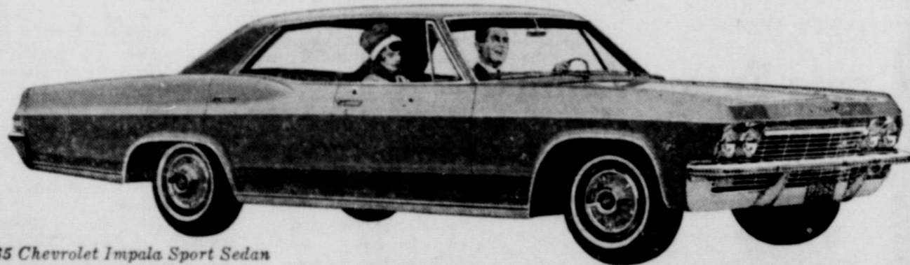
'65 Chevrolet Impala Sport Sedan