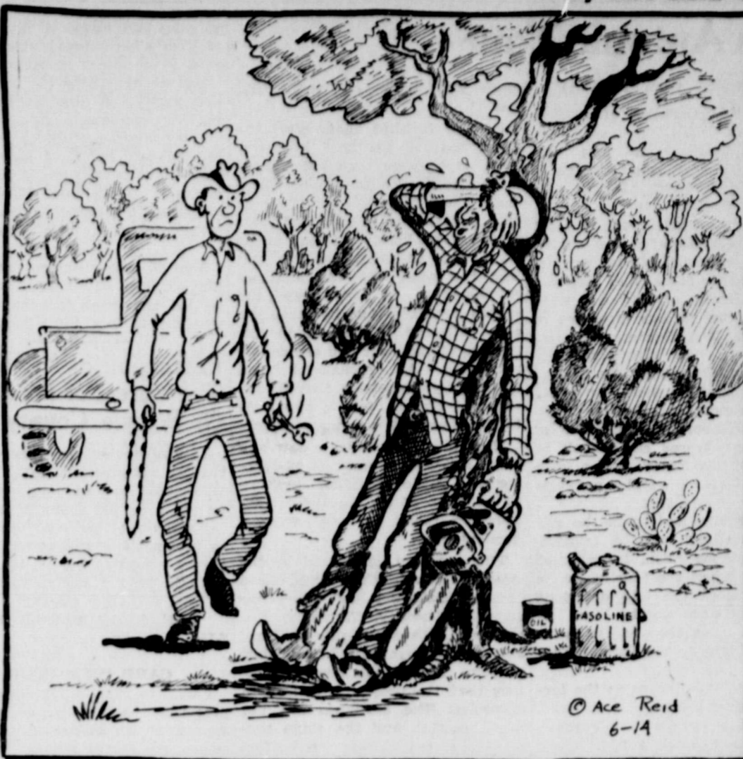
"If we worked as hard asawin' as we do startin' this thing, we'd have 10,000 acres cleared!"