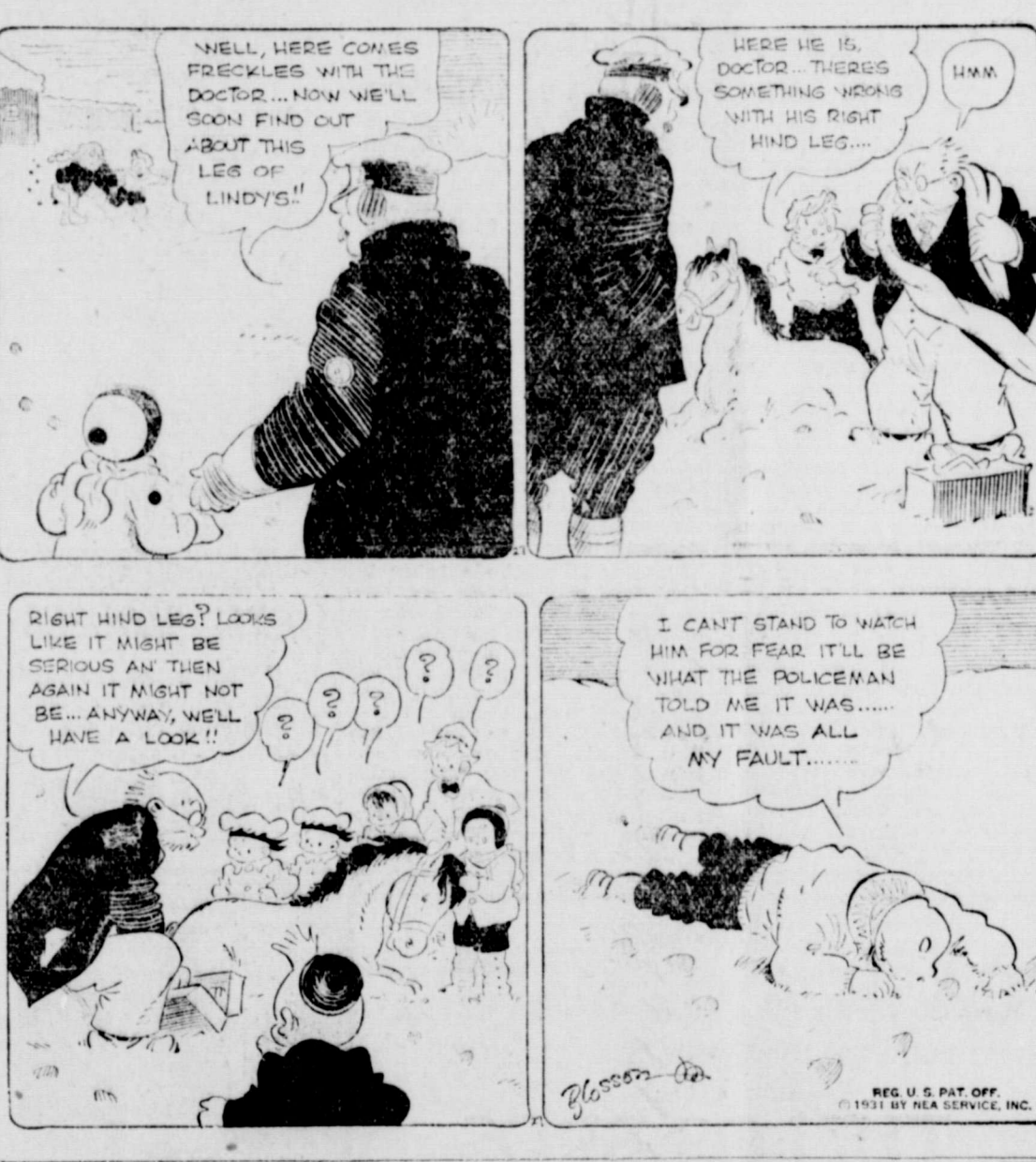
REG. U. S. PAT. OFF. ©1931 BY NEA SERVICE, INC.