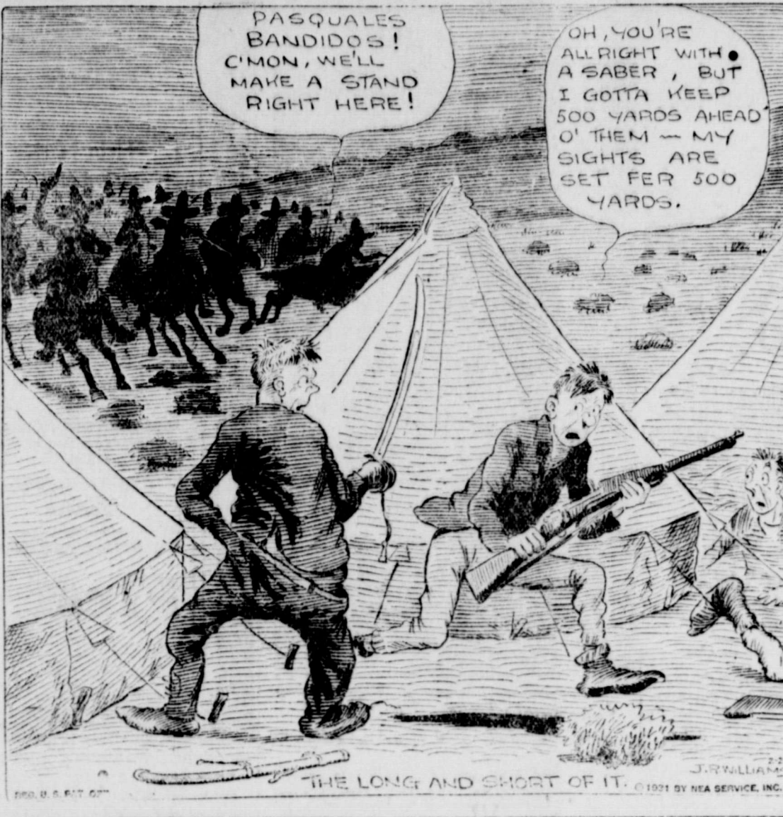
THE LONG AND SHORT OF IT.