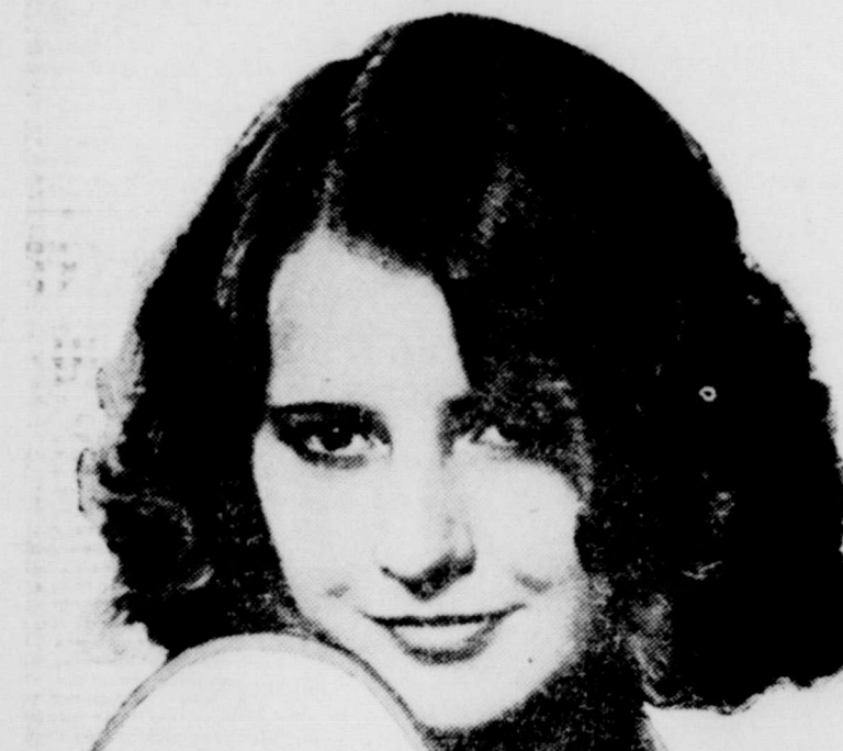
Red-Headed BARBARA STANWYCK who makes a great story twice as great!