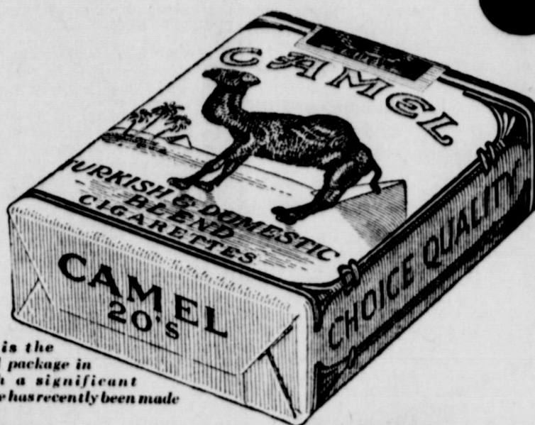
This is the Camel package in which a significant change has recently been made