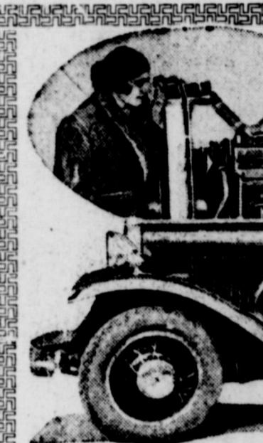
Miss Europe, 19 year old Grecian beauty chosen queen of European pulchritude in 1930, takes delivery of her new 100 horsepower Free Wheeling Huppobile Eight. Upper left—Miss Europe inspects a Hupp engine in the "room" in aviator's uniform where temperature is 25 below zero.

All Models in both Six and Eights Free Wheeling Standard Equipment.