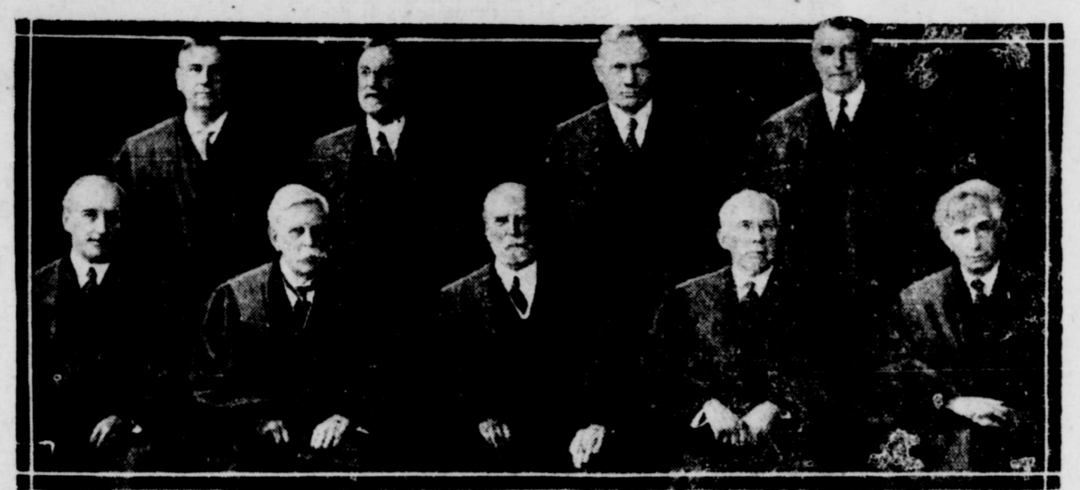
First Photo of High Court With Hughes Presiding

Here is the first official photograph of the nation's highest court as it is now constituted—the supreme court under the leadership of Chief Justice Charles Evans Hughes, who succeeded the late Chief Justice William Howard Taft.