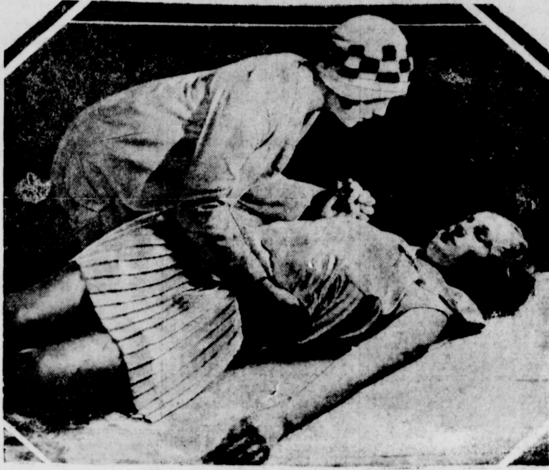
The girl she had struck lay motionless at the side of the road. The pitiful sight tore at Helen's heart.

THIS HAS HAPPENED HELEN PAGE feels unhappy in her classmates' eyes because she is being guarded by her guardian, LEONARD BRENT. But he represents all that she knows of home and family and though he refuses to clear the mystery of her birth until her graduation, however, a chance meeting with a dying beggar, CHARLES BENS NELLIN, causes Brent to change all his plans regarding her future. Before the man dies, Brent secures facts and evidence which he is able to incorporate to some extent by a visit to Yonkers. On graduating, Helen reminds her guardian of his promise to tell her about her parents, and is amazed when he informs her that she is heiress of a millionaire, ERIL K. CUNNINGHAM, and that he promised her parents to leave her to her grandfather when she was 18. Brent takes her to Yonkers and introduces her to Cunningham as his granddaughter. He tells the story and offers proof in the locked containing the name of EVANGELINE CUNNINGHAM NELLIN which he had seen from the dying beggar. Cunningham and his lawyer remain at Bramblewood until an investigation is made. Brent favors this, but the objects, resenting the fact that she is under suspicion, Brent leaves her stay and the old man tries to win her love by a gift—surprise, he tells her.