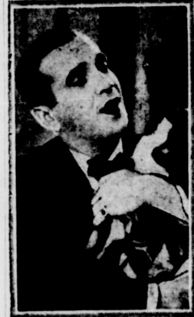
Al Jolson in "Say It With Songs" starring Al Jolson. A Warner Bros. Production.

Everybody who attended last night's performance of "Say It With Songs" is talking Al Jolson. The star of "The Jazz Singer" and "The Singing Fool" is here again