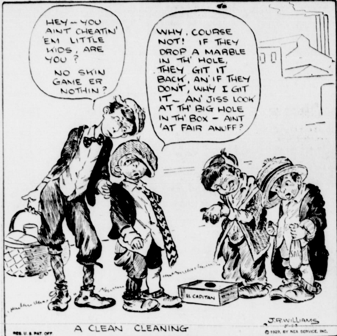
A CLEAN CLEANING. JR WILLIAMS. 1929. BY NEA SERVICE, INC.