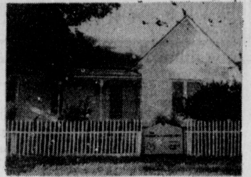
ROBERT E. HOWARD MUSEUM Price 50¢