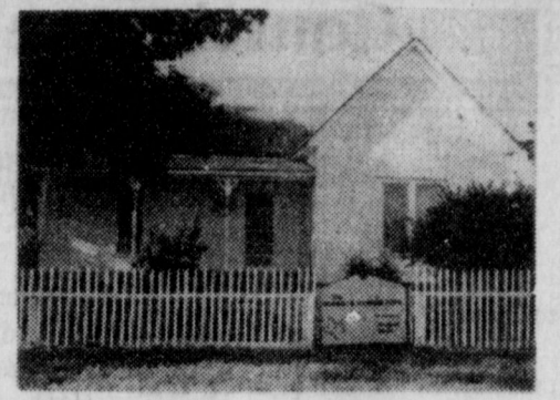
ROBERT E. HOWARD MUSEUM Price 50¢