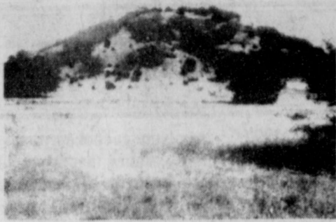
WEST CADDO PEAK