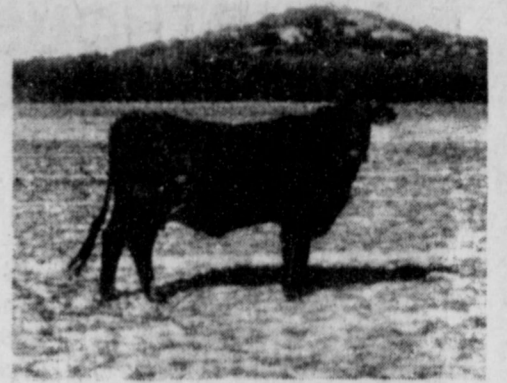
EAST CADDO PEAK Price 50¢