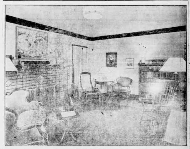
w. m. mishings, and new eye-comfort for the family, resulted when the lighting in this living room was modernized.