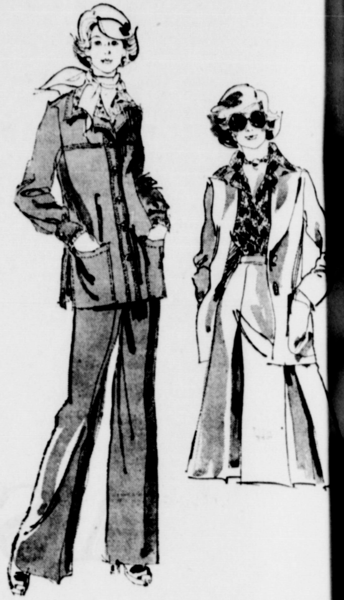
JUST IN TIME FOR THE HOLIDAYS