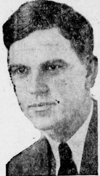
CONGRESSMAN GEORGE MAHON Who will speak at 4:30 P. M. Monday during Trades Day in Muleshoe.