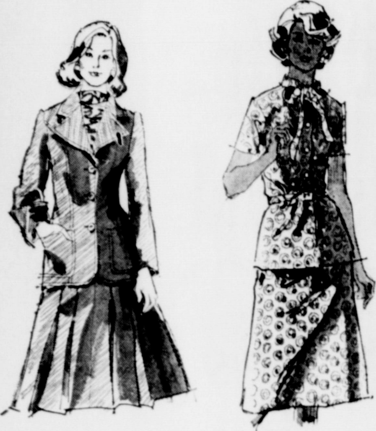
LADIES FASHIONS IN POLYESTER