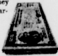
If they're lost, stolen, or destroyed, we replace 'em

And a perfect excuse for getting goose bumps the next time they play the Star Spangled Banner.