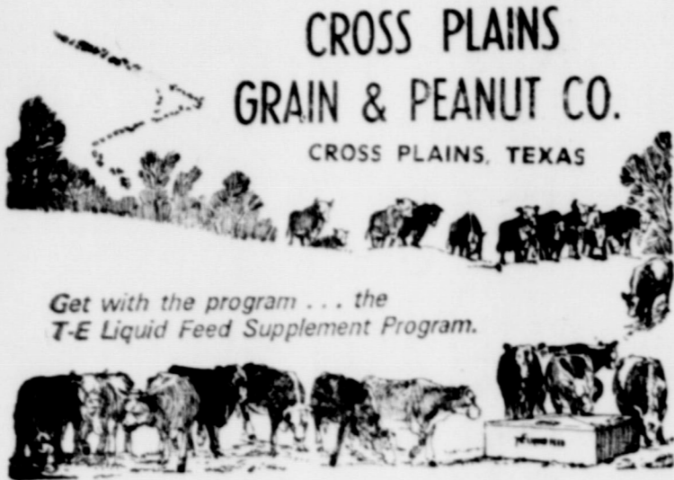
Get with the program... the T-E Liquid Feed Supplement Program.