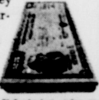
If they're lost, stolen, or destroyed, we replace 'em

And a perfect excuse for getting goose bumps the next time they play the Star-Spangled Banner.