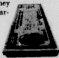
If they're lost, stolen, or destroyed, we replace 'em.

And a perfect excuse for getting goose bumps the next time they play the Star-Spangled Banner.