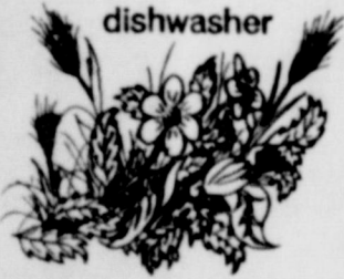
Give Mom a Frigidaire dishwasher on her day

Smart styling is only how good Frigidaire looks — the real worth of Frigidaire is how good it cleans dishes, pots, pans, glasses and silverware.