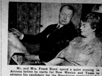
Mr. and Mrs. Frank Knox spend a quiet evening in Arizona before he starts for New Mexico and to advance his candidacy for the Republican nomination for the presidency.