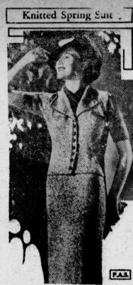
NEW YORK... Above is pictured a hand-knitted sport suit for Spring that gets its inspiration from English tailoring...