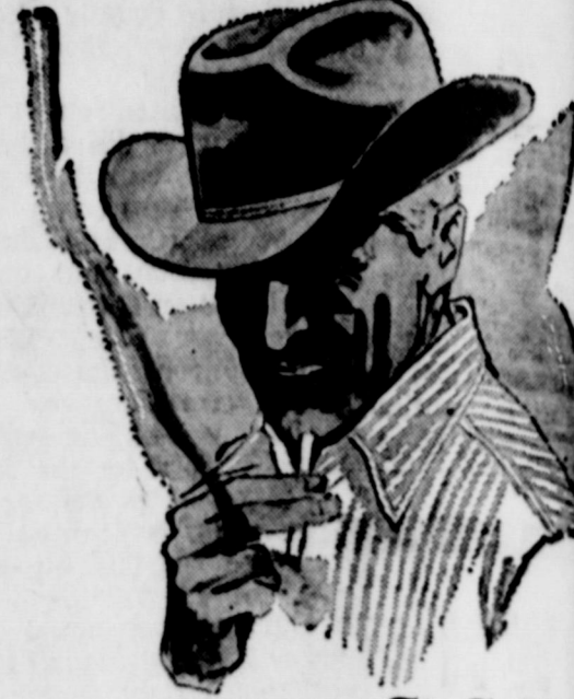
The Western who chooses a horse that sits