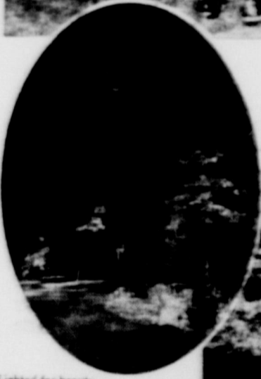
Lighted for beauty and outdoor living