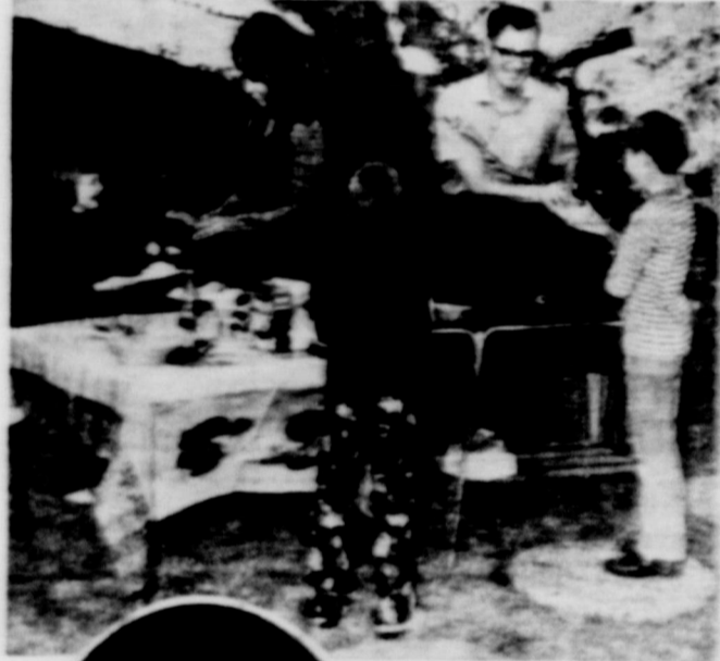
Portable electric grill