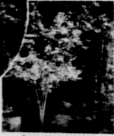
Permanent electric barbecue pit and lighted back yard

Electricity adds fun and extra hours to outdoor living